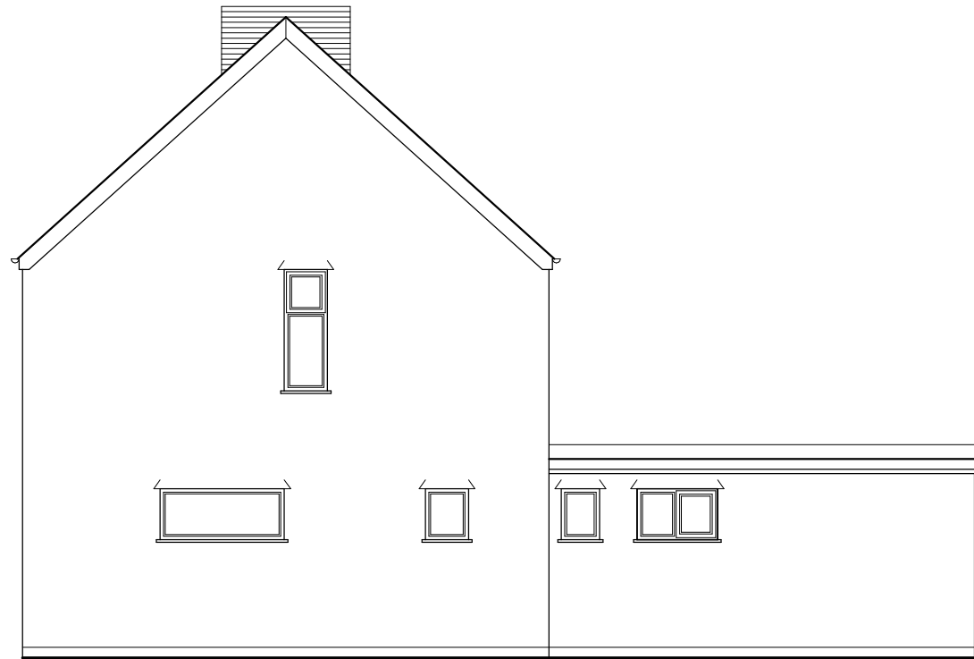
existing side elevation