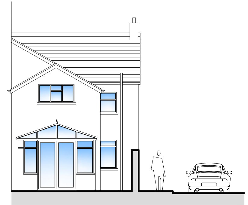
existing rear elevation