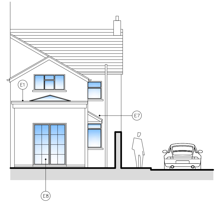
proposed rear elevation