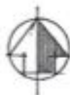
LOCATION PLAN. 1:2500