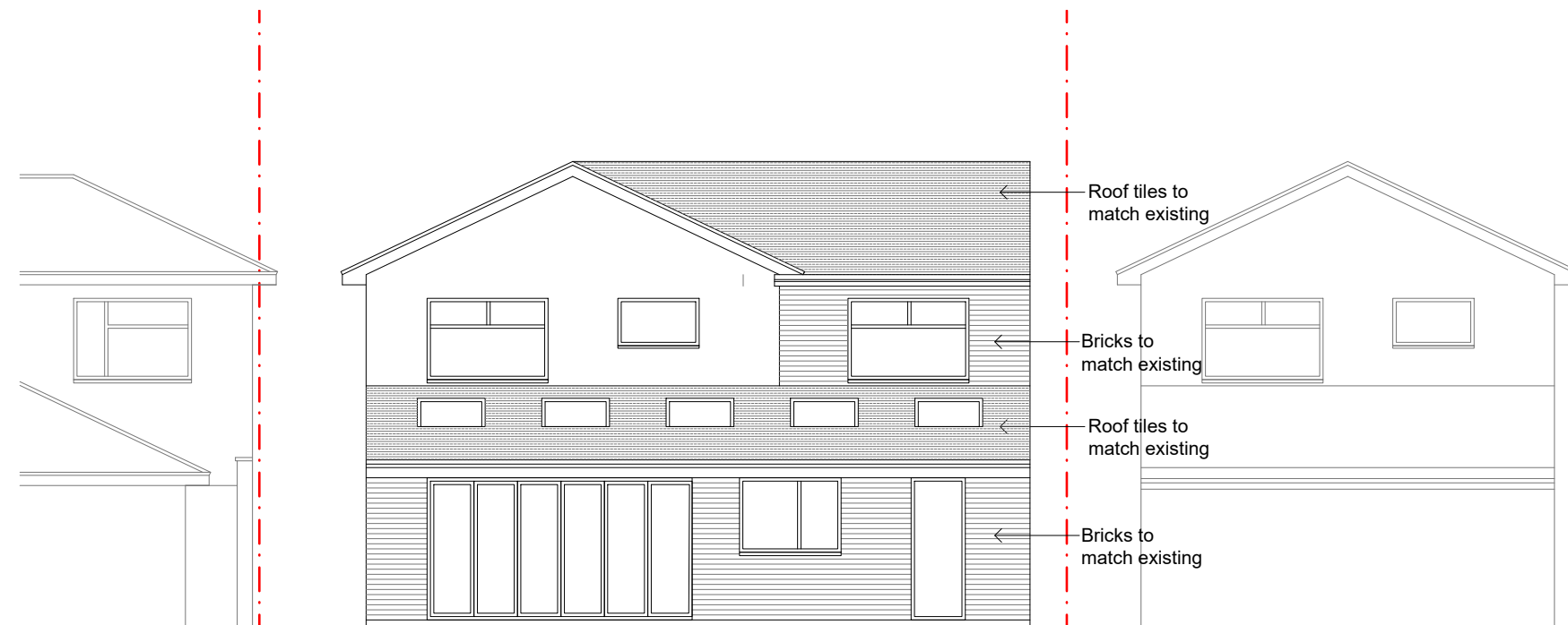
PROPOSED REAR ELEVATION North West Facing