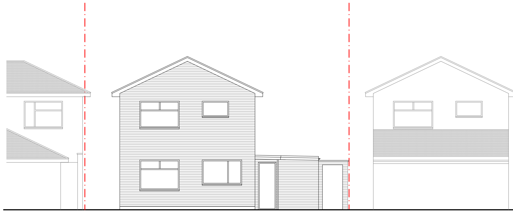
EXISTING REAR ELEVATION North West Facing