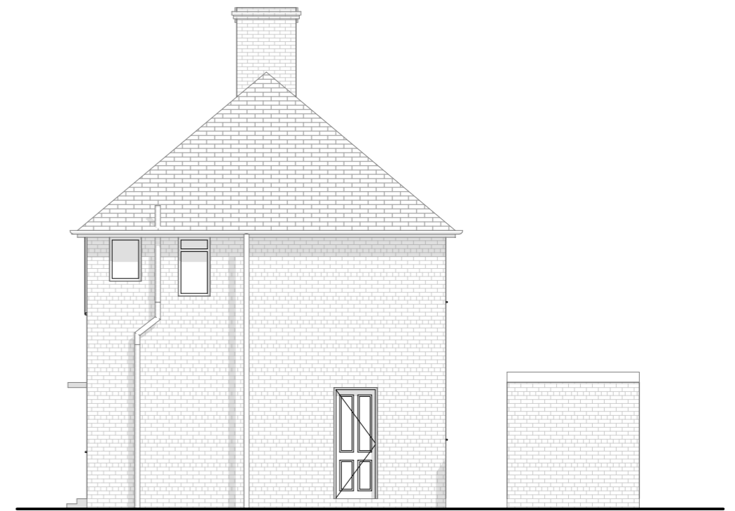
03 EXISTING NORTH-WESTERN ELEVATION (SIDE) 1:100