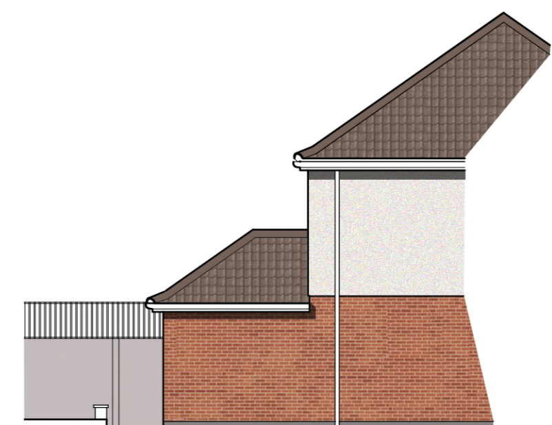
Existing Part South Elevation Scale 1:100