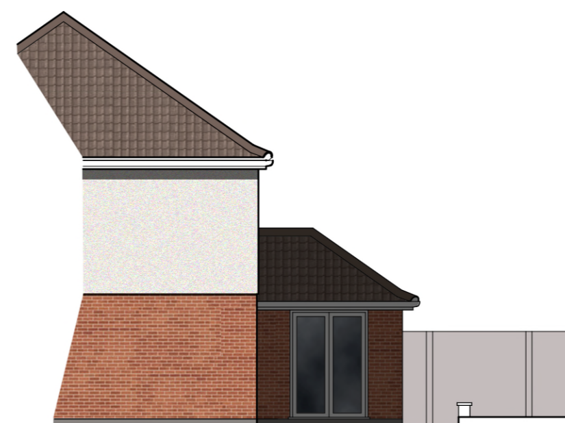
Existing Part North Elevation Scale 1:100