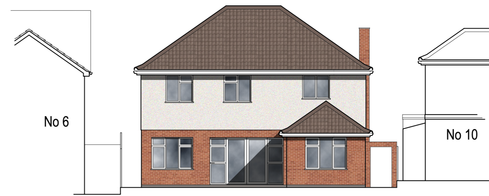
Existing West Elevation Scale 1:100