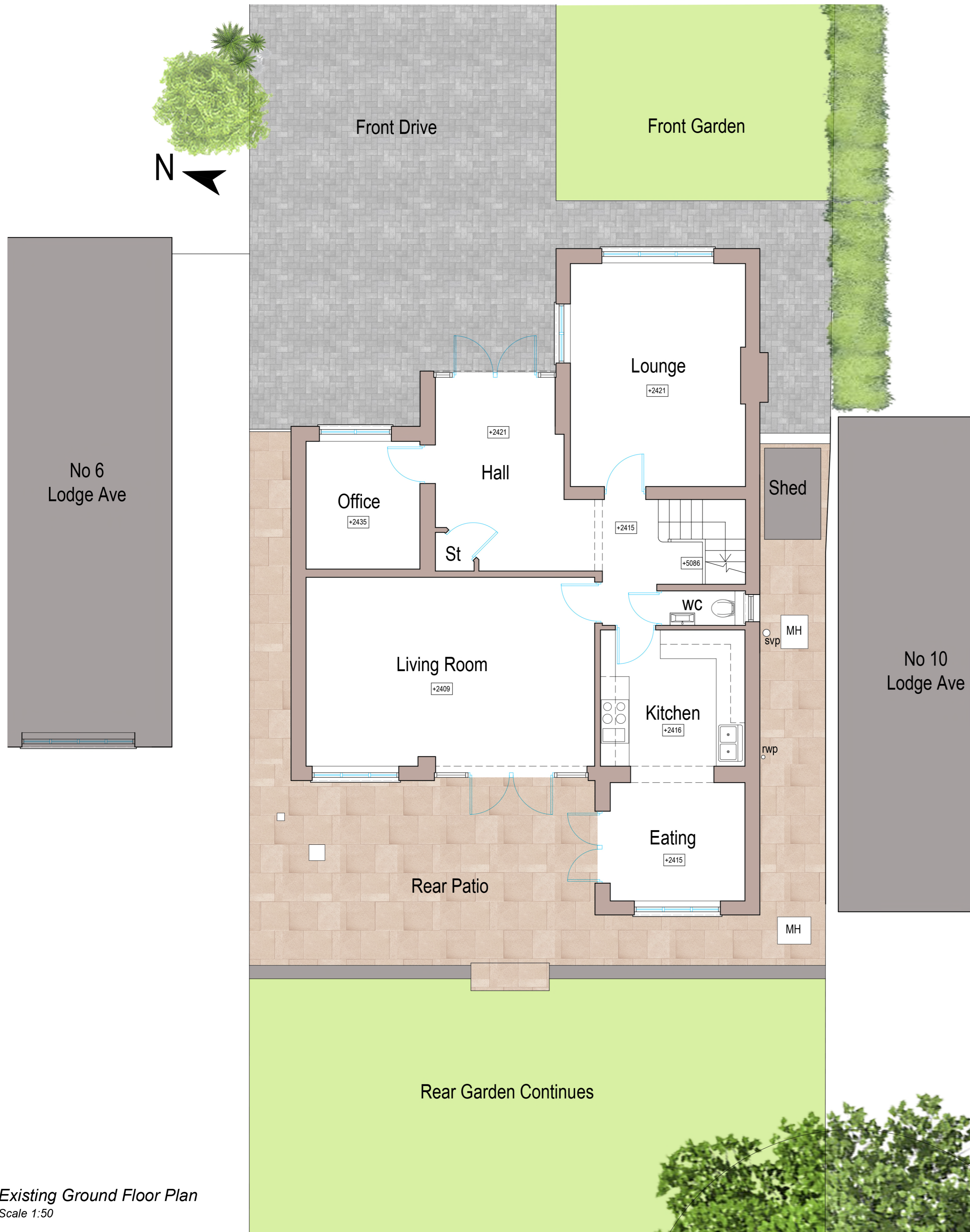
Existing Ground Floor Plan Scale 1:50