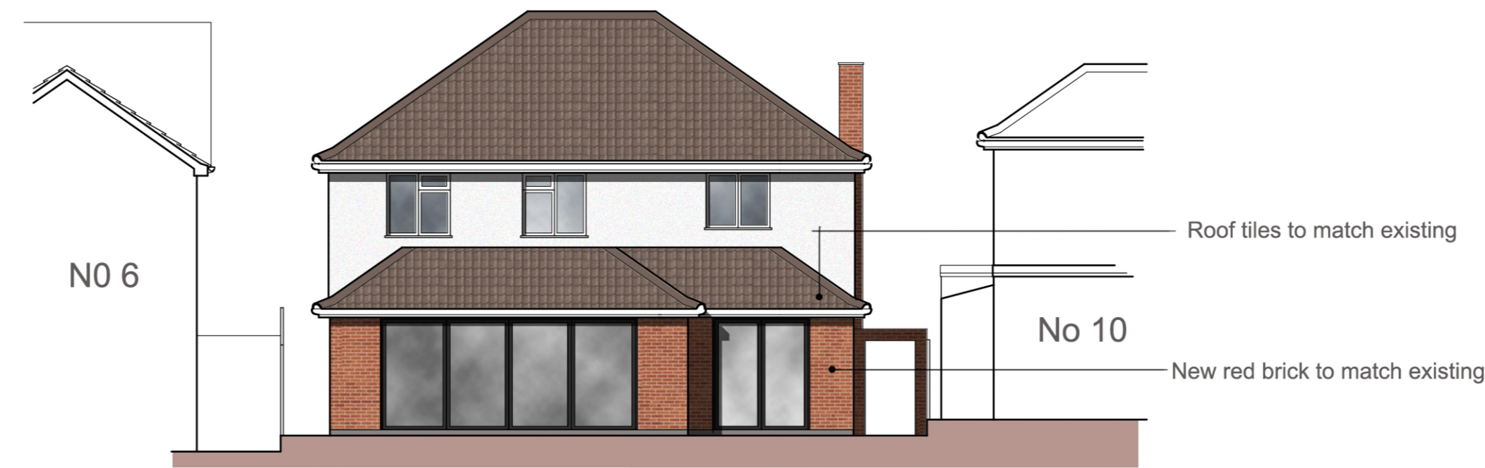
Proposed (Rear) West Elevation Scale 1:100