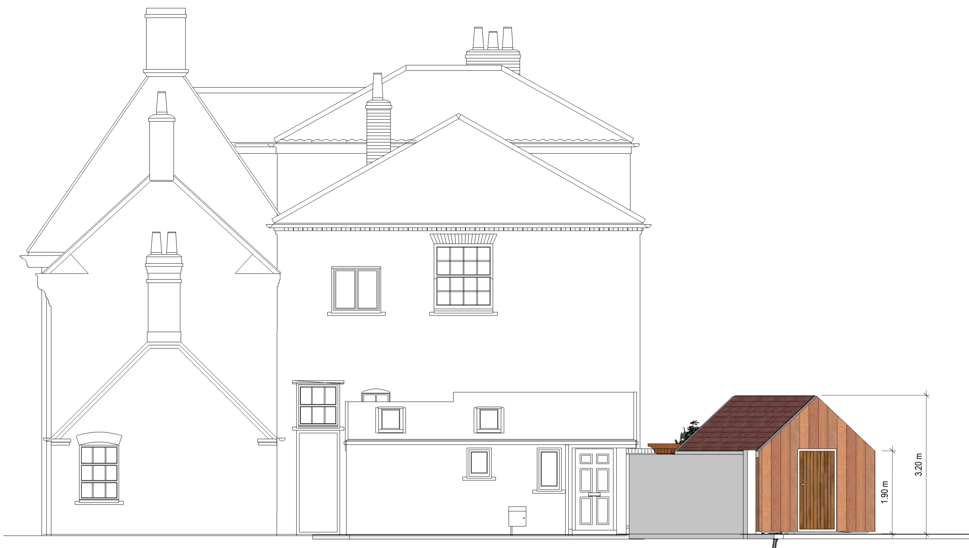
FRONT (NORTH WEST)