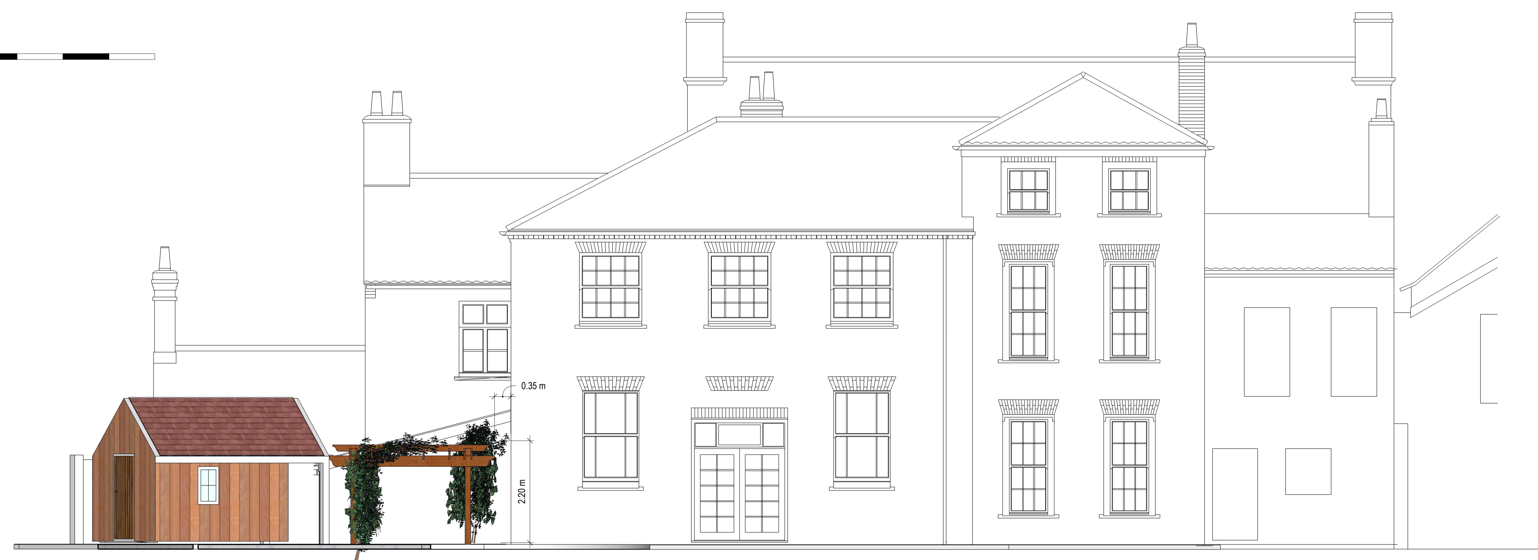
SIDE (SOUTH WEST)