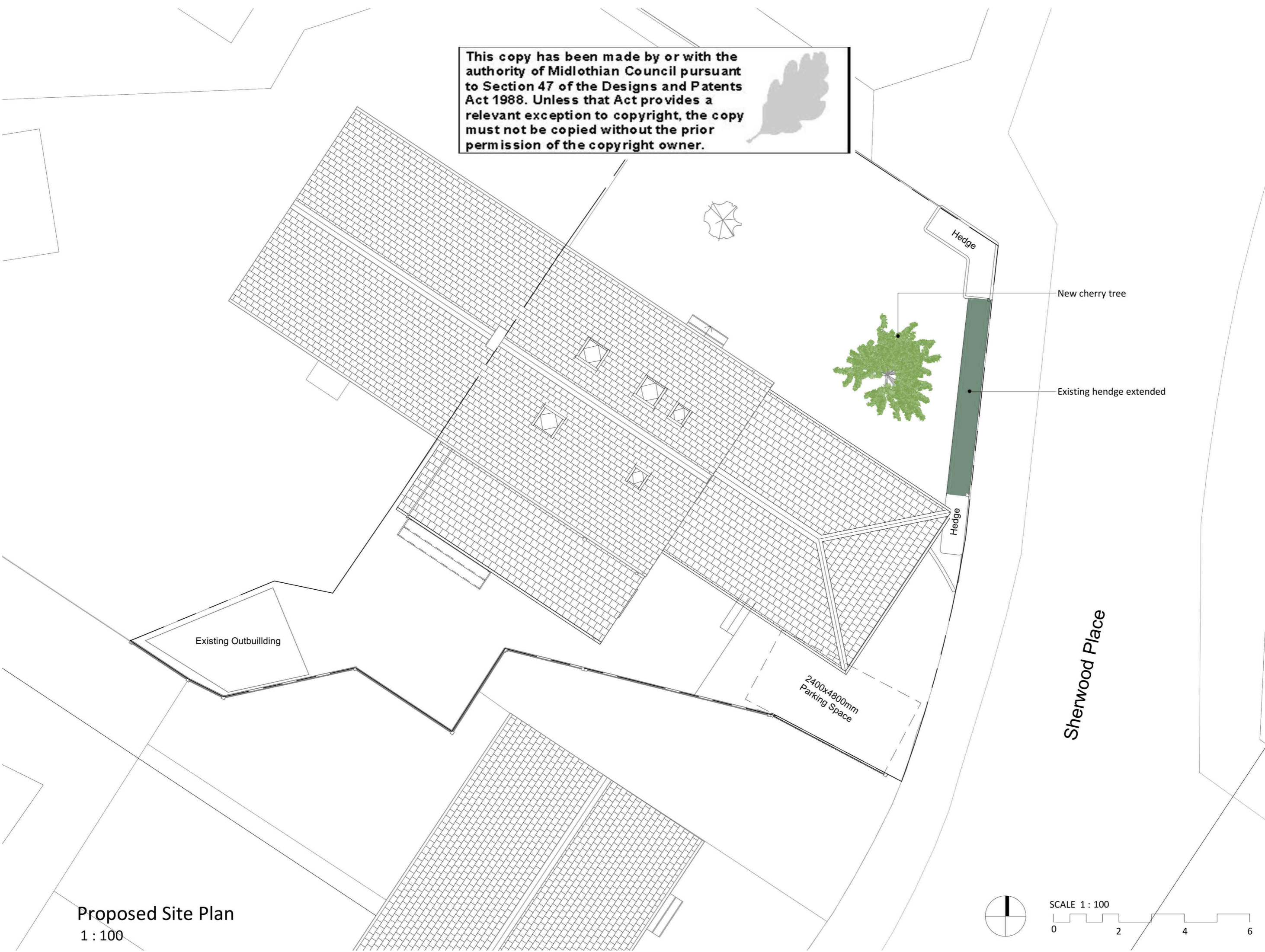
Proposed Site Plan 1 : 100