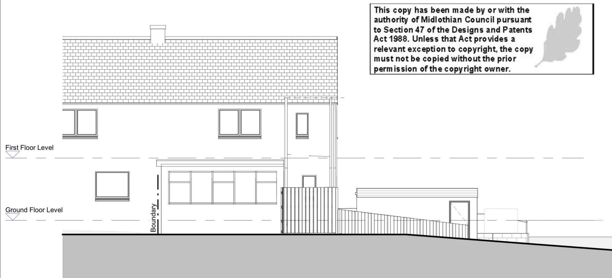
Existing South Elevation 1 : 100

This copy has been made by or with the authority of Midlothian Council pursuant to Section 47 of the Designs and Patents Act 1988. Unless that Act provides a relevant exception to copyright, the copy must not be copied without the prior permission of the copyright owner.