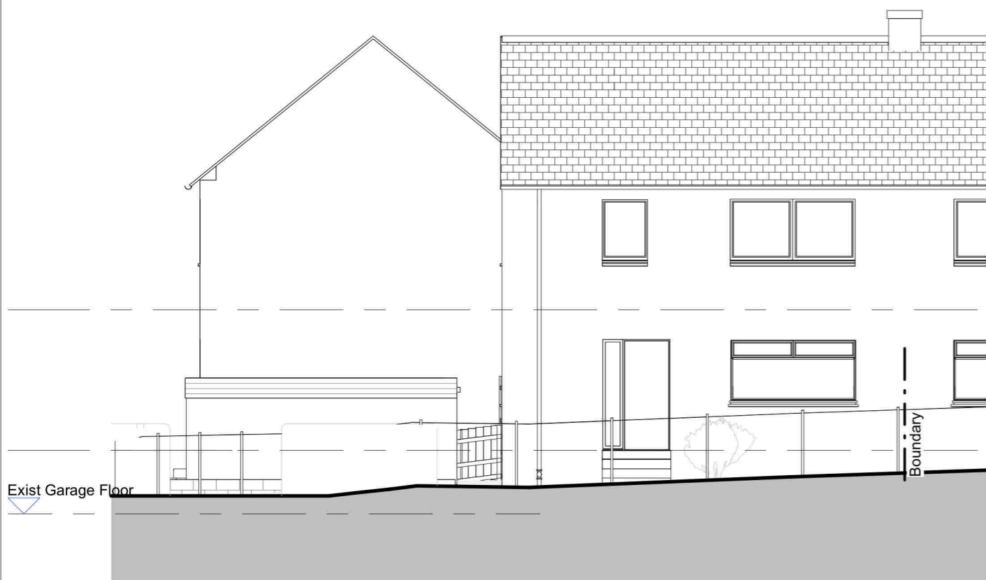
Existing North Elevation 1 : 100