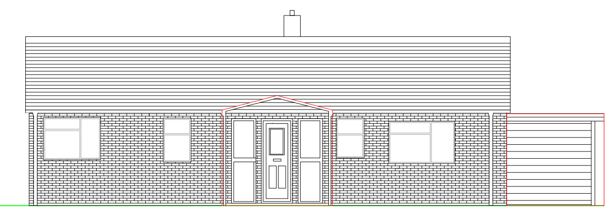
Proposed Front Elevation (1:100)