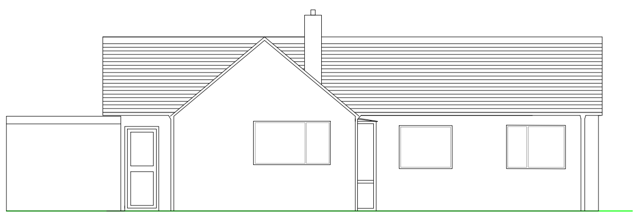
Existing Rear Elevation (1:100)