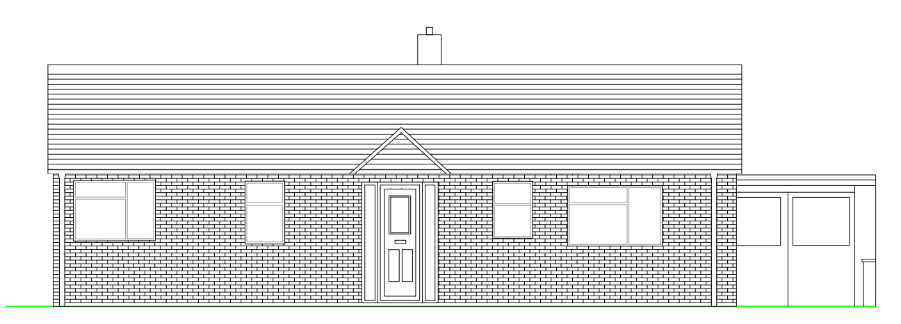
Existing Front Elevation (1:100)