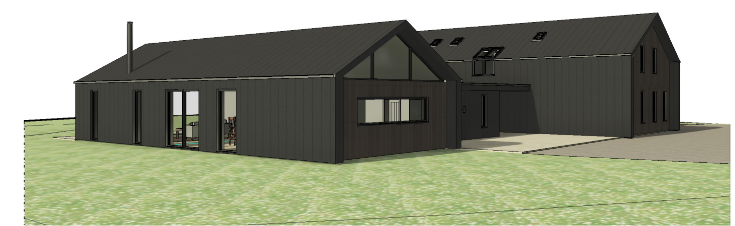
South East Perspective