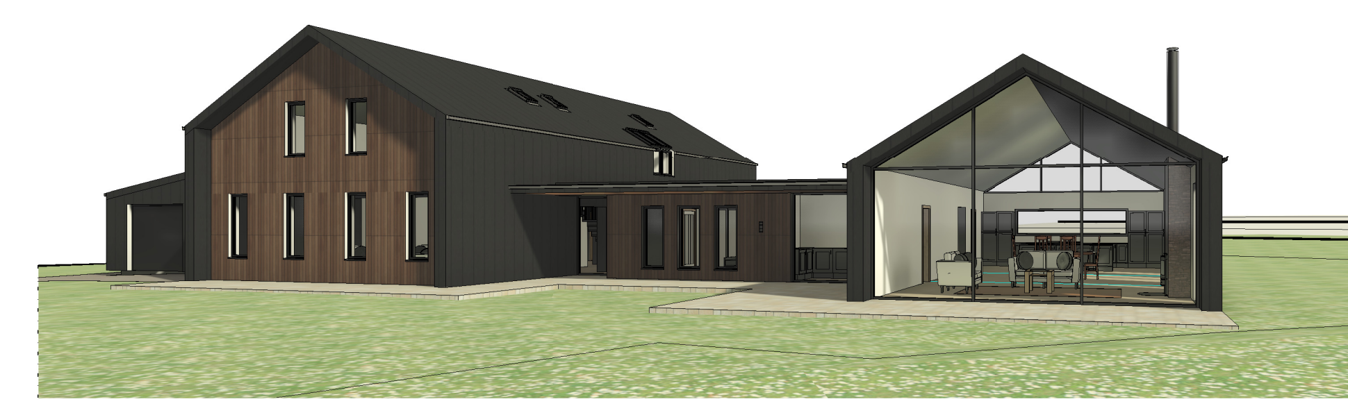
South West Perspective