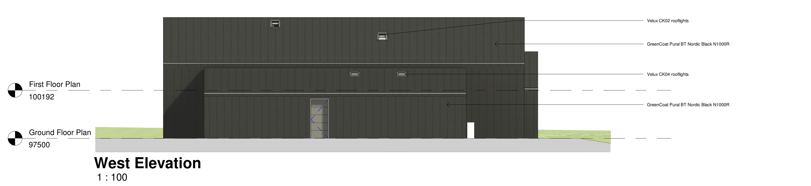
West Elevation 1 : 100