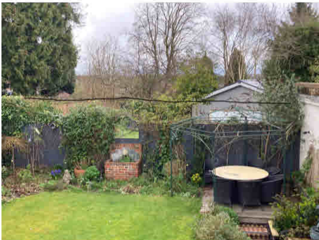
View of rear fence with "mark up" of trellis position