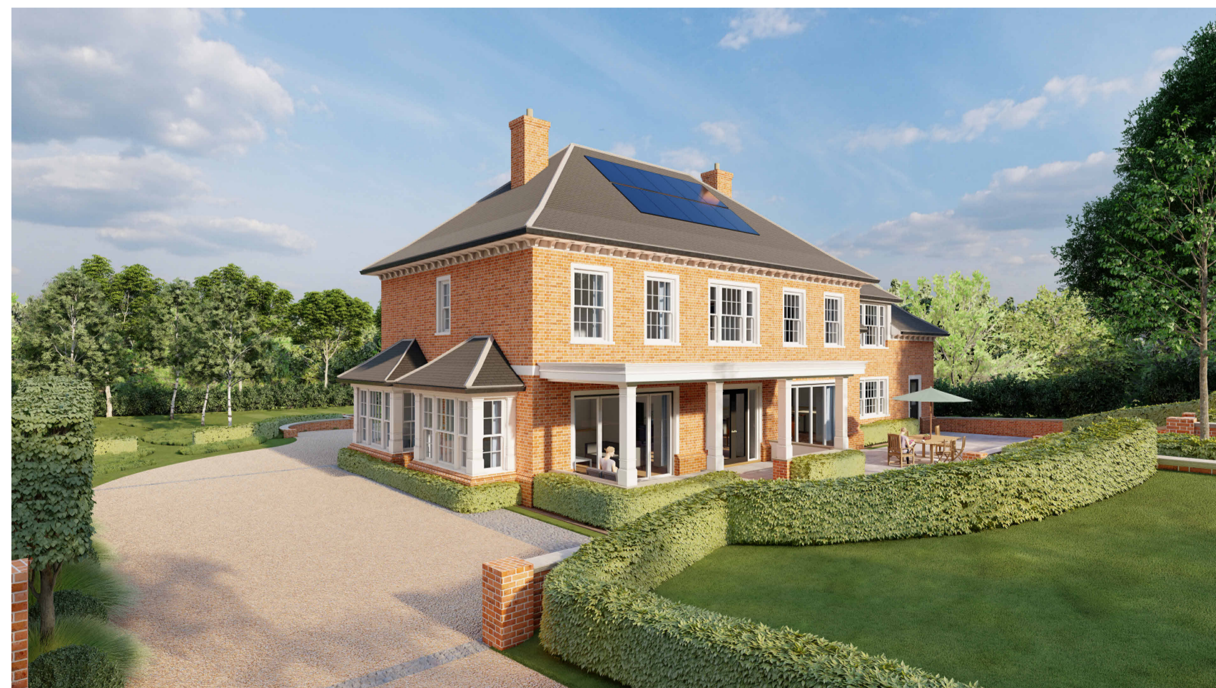
INDICATIVE 3D VIEWS