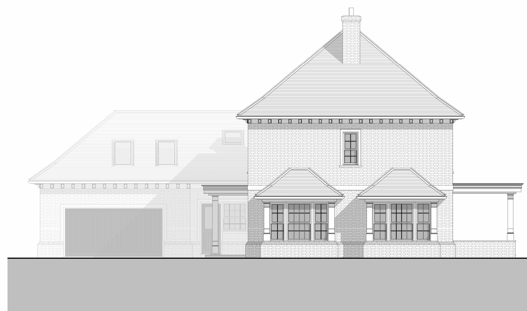
SIDE (WEST) ELEVATION