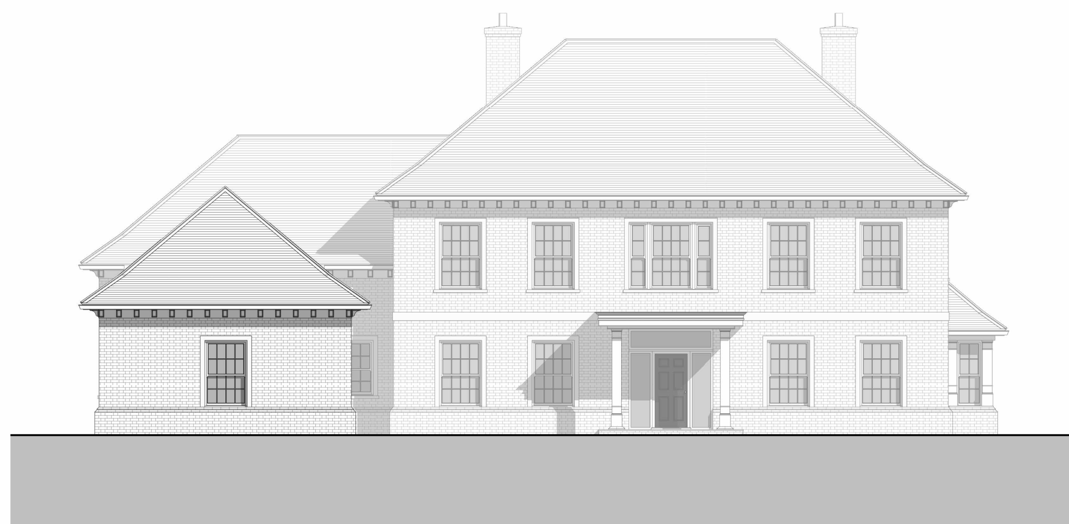
FRONT (NORTH) ELEVATION

Notes: DoNot Scale. Use only figured dimensions. all dimensions to be checked on site prior to construction. Any discrepancies to be notified to the architects. All Copyright Reserved to Offset Architects.