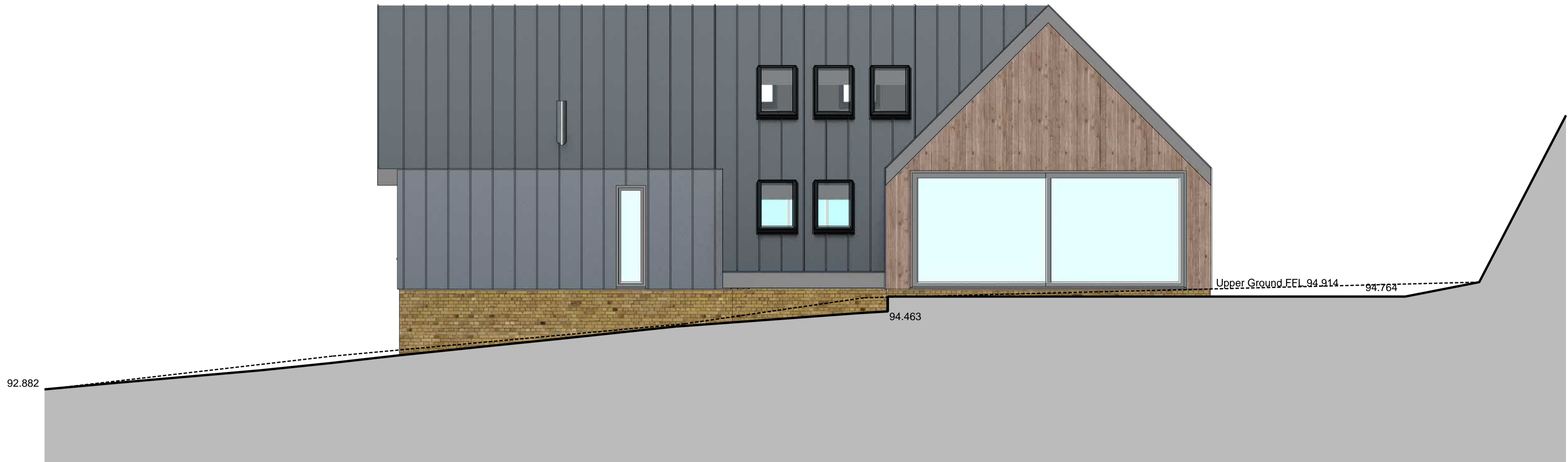
Proposed South (Flank) Elevation

© Smart Architecture Ltd All rights reserved. Use figures dimensions only. Do not scale from this drawing - this note is for planning purposes ONLY All levels and dimensions to be checked on site by contractor. Any discrepancy to be verified by the Architect before proceeding. Drawing to be read in conjunction with all relevant SA drawings and specification clauses. The Contractor and relevant fabricated products to be built to current British and European Standards. This drawing must not be used for Land Transfer unless stated as 'Conveyance' This drawing and its subject matter are the confidential property of Smart Architecture Ltd and shall not be copied, reproduced, used or disclosed to others without the prior written authority of Smart Architecture Ltd.