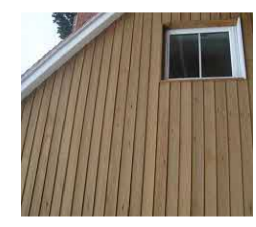
Natural coloured composite timber cladding to gables walls at first floor level