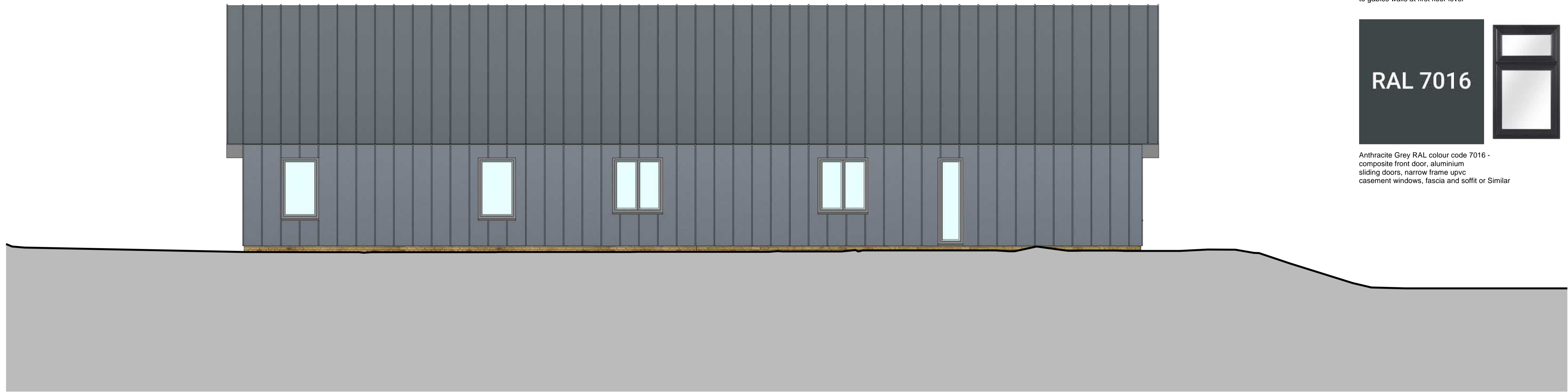
Proposed East (Rear) Elevation