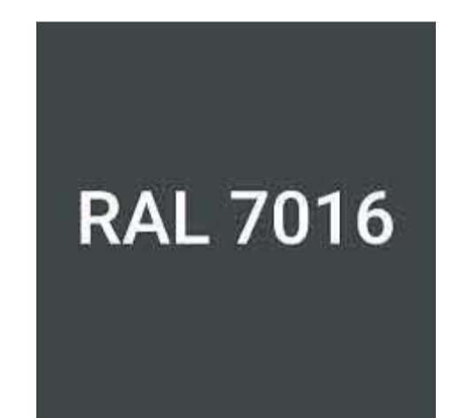
Anthracite Grey RAL colour code 7016 - composite front door, aluminium sliding doors, narrow frame upvc casement windows, fascia and soffit or Similar