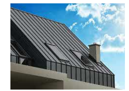
Anthracite Grey RAL colour code 7016 - metal standing seam roof and first floor external wall finish