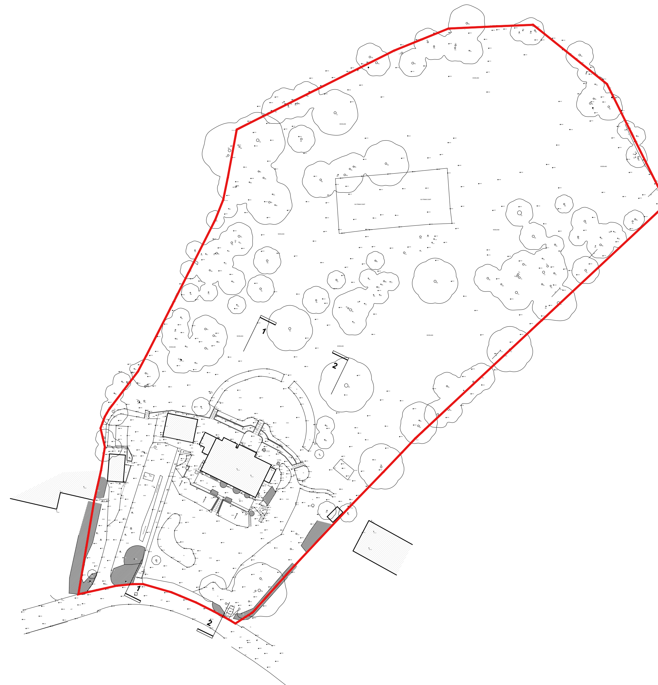
1 PLAN EXISTING SITE BLOCK PLAN SCALE 1:500