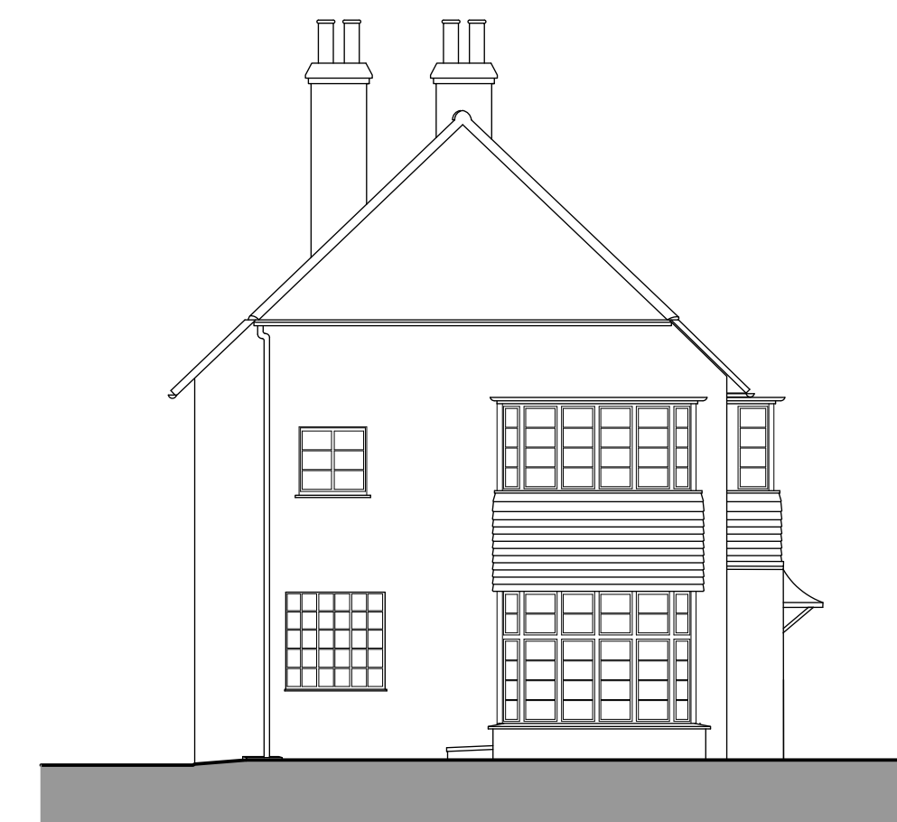
2 ELEVATION EXISTING EAST ELEVATION SCALE 1: 100