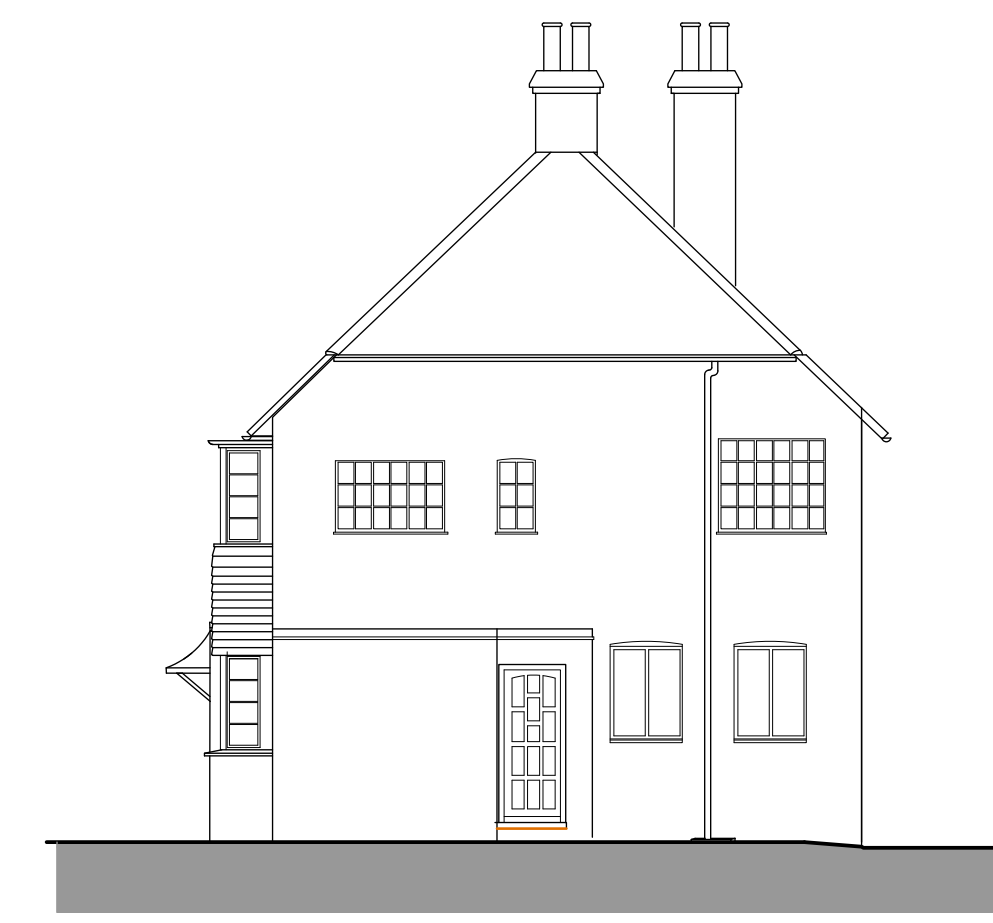
4 ELEVATION EXISTING WEST ELEVATION SCALE 1: 100