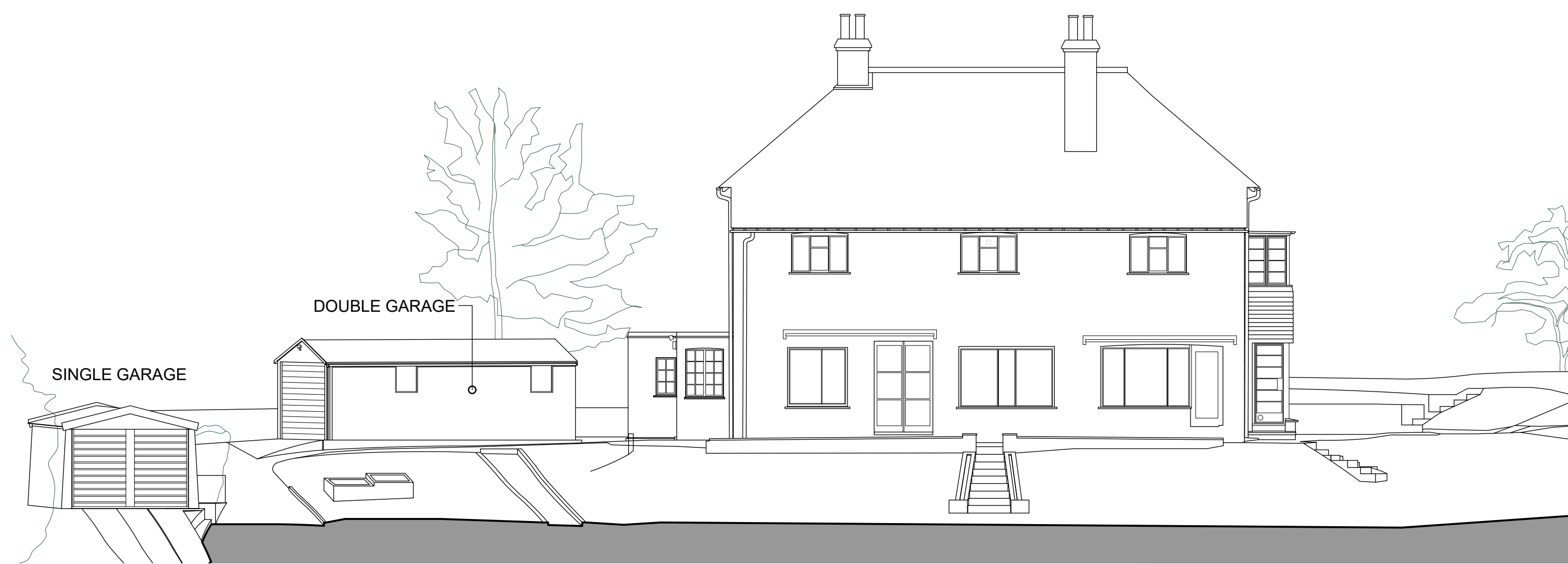
1 ELEVATION EXISTING SOUTH ELEVATION SCALE 1: 100