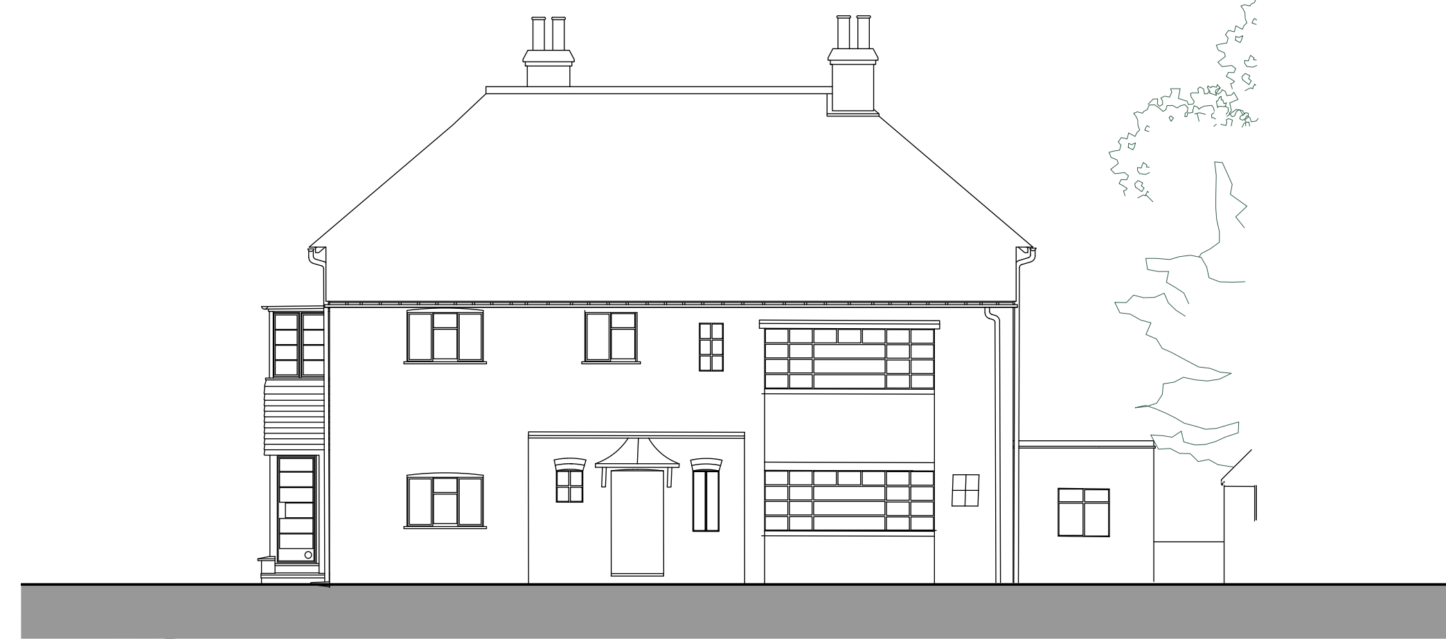
3 ELEVATION EXISTING NORTH ELEVATION SCALE 1: 100