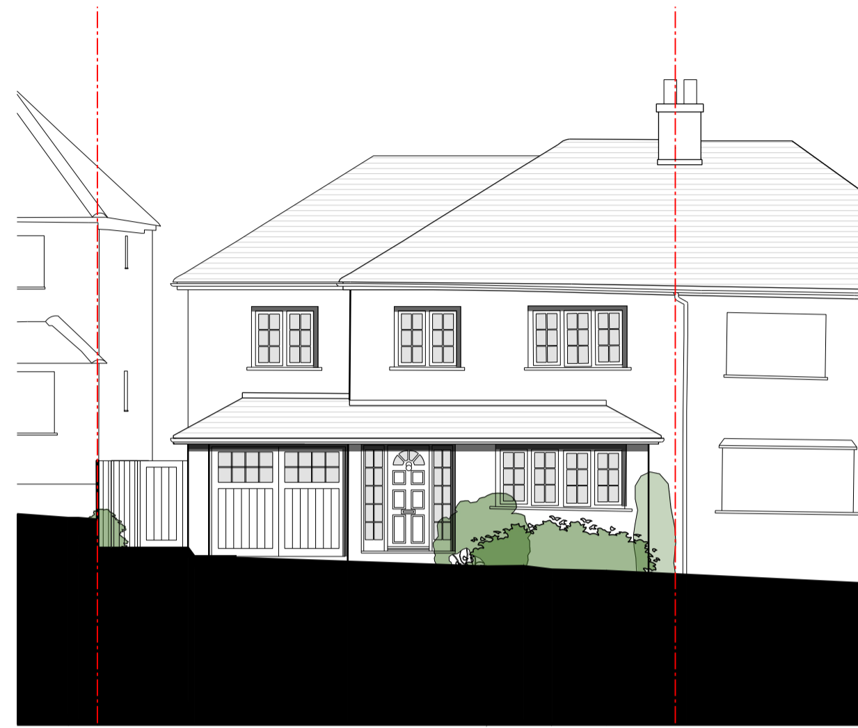
1 ELEVATION FRONT ELEVATION SCALE 1:100