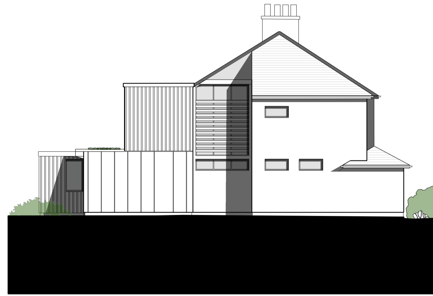
2 ELEVATION SIDE ELEVATION SCALE 1:100