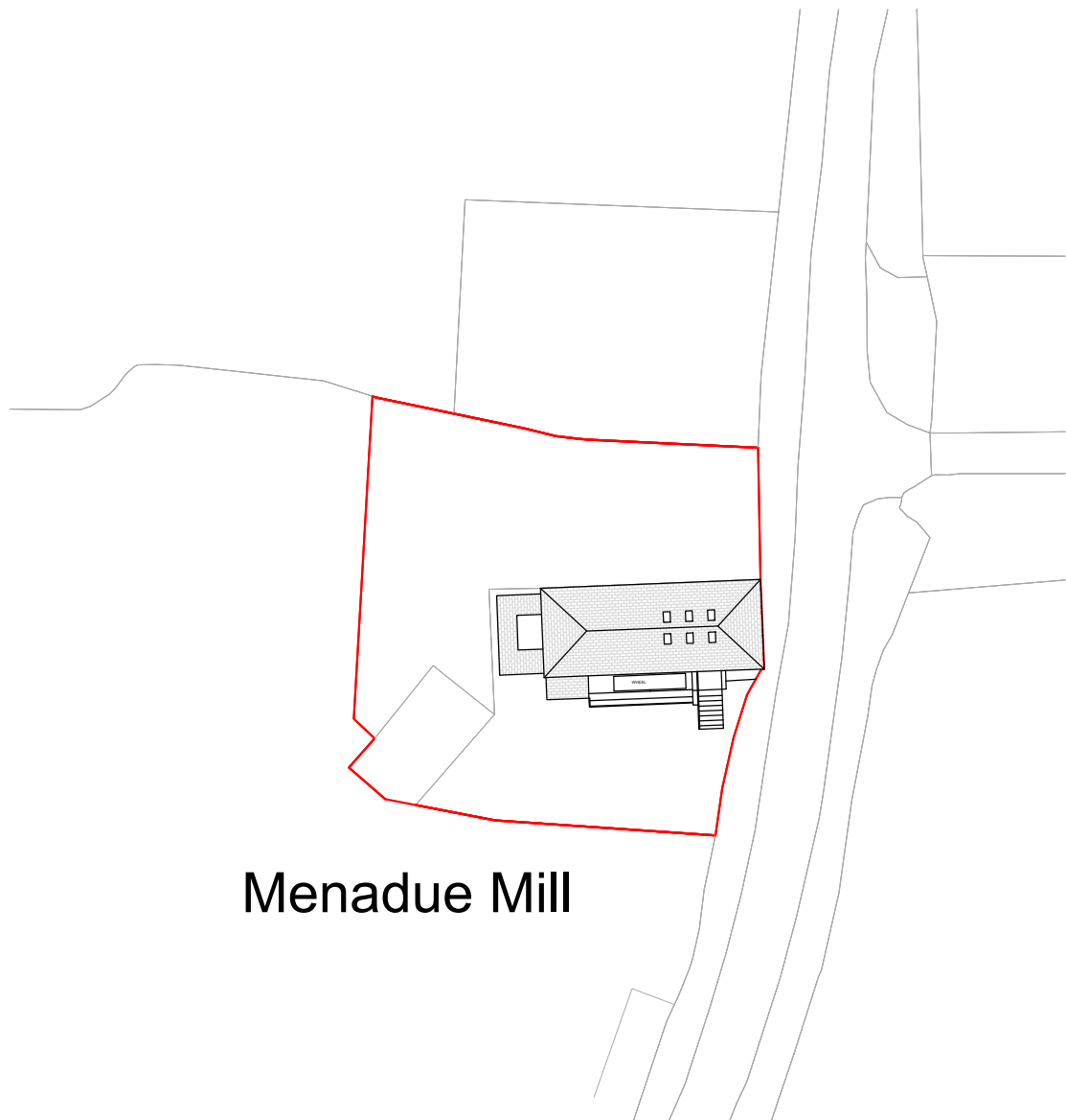
LOCATION PLAN 1:2500