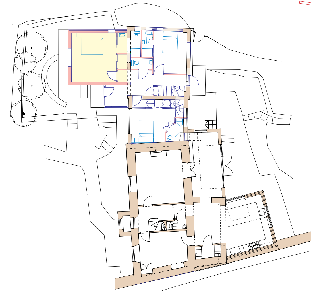
SOUTH - EAST ELEVATION.