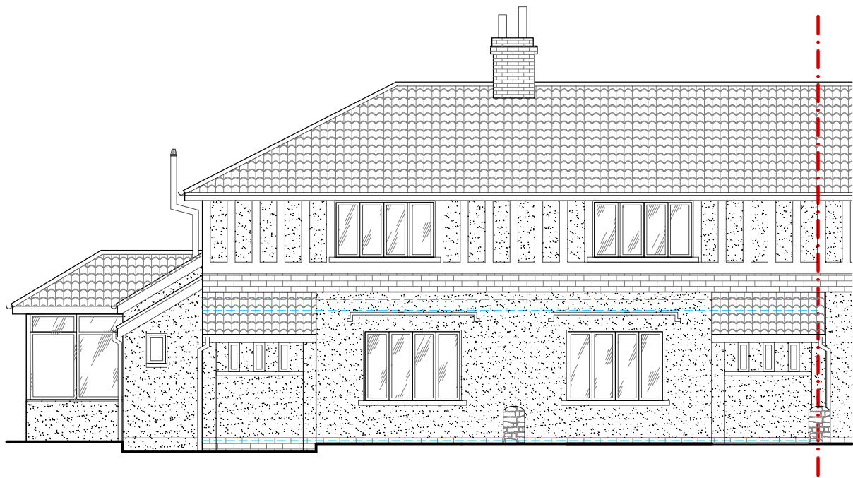
EXISTING REAR (NORTH WEST) ELEVATION