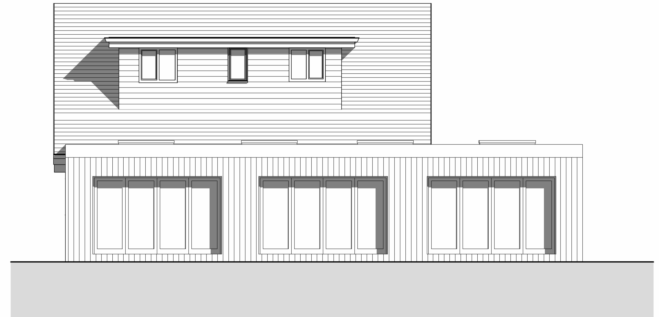
2 Rear Elevation_Proposed 1 : 50