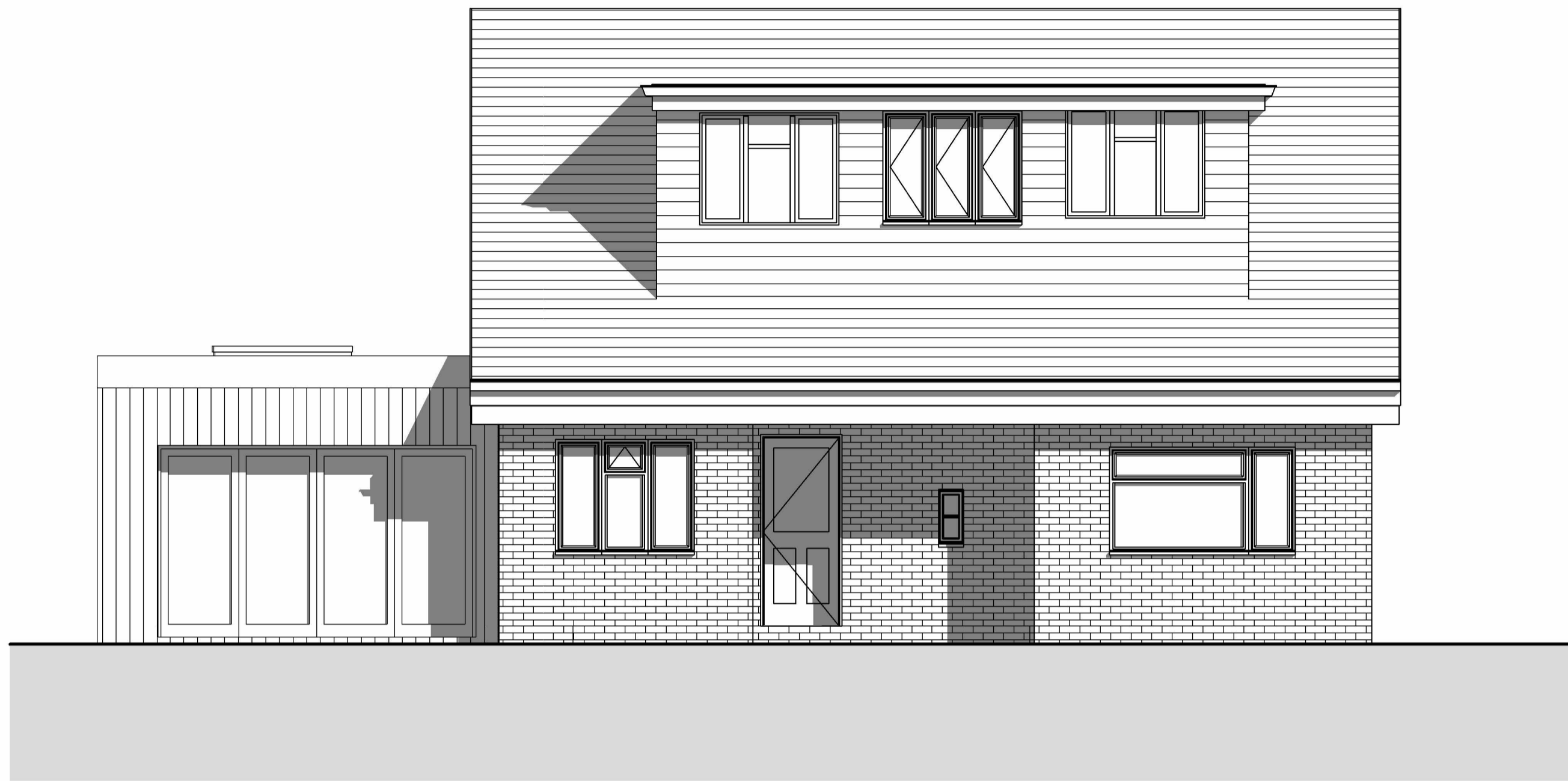
1 Front Elevation_Proposed 1 : 50