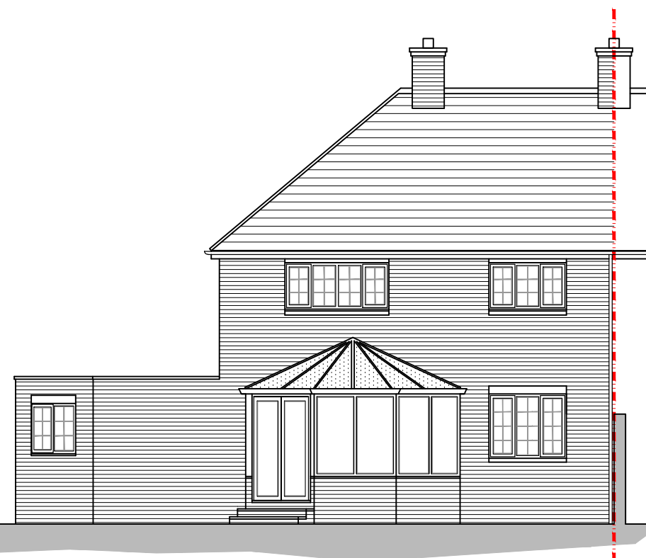
South east elevation scale 1:100