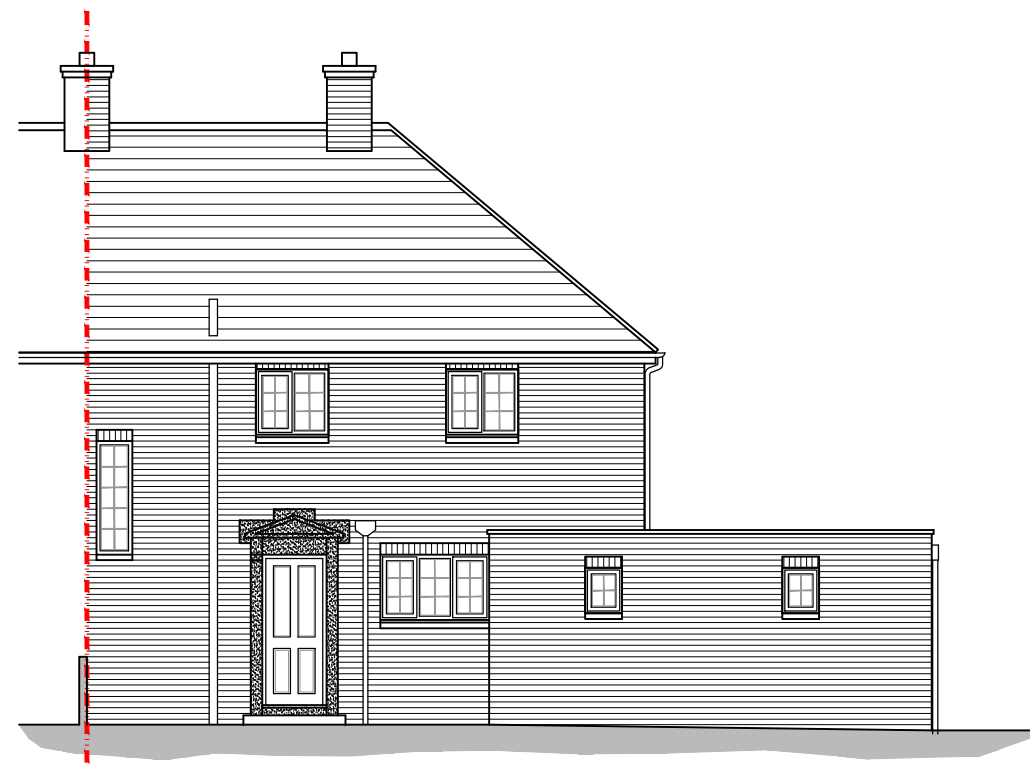
North west elevation scale 1:100