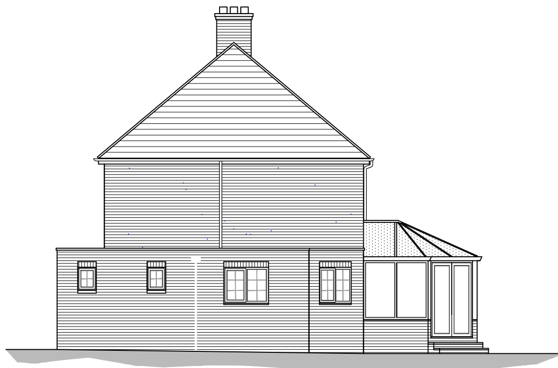
South west elevation scale 1:100