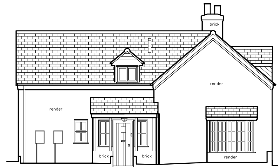
EXISTING NORTH EAST ELEVATION REF. NO.: BD635 EE2