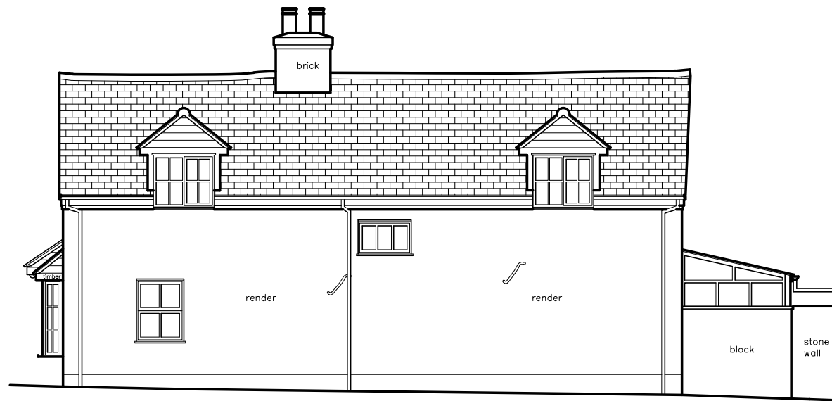
EXISTING NORTH WEST ELEVATION REF. NO.: BD635 EE1