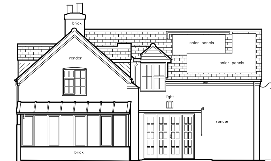
EXISTING SOUTH WEST ELEVATION REF. NO.: BD635 EE4