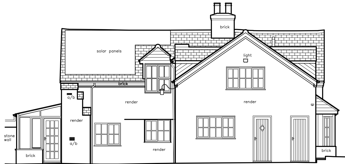
EXISTING SOUTH EAST ELEVATION REF. NO.: BD635 EE3