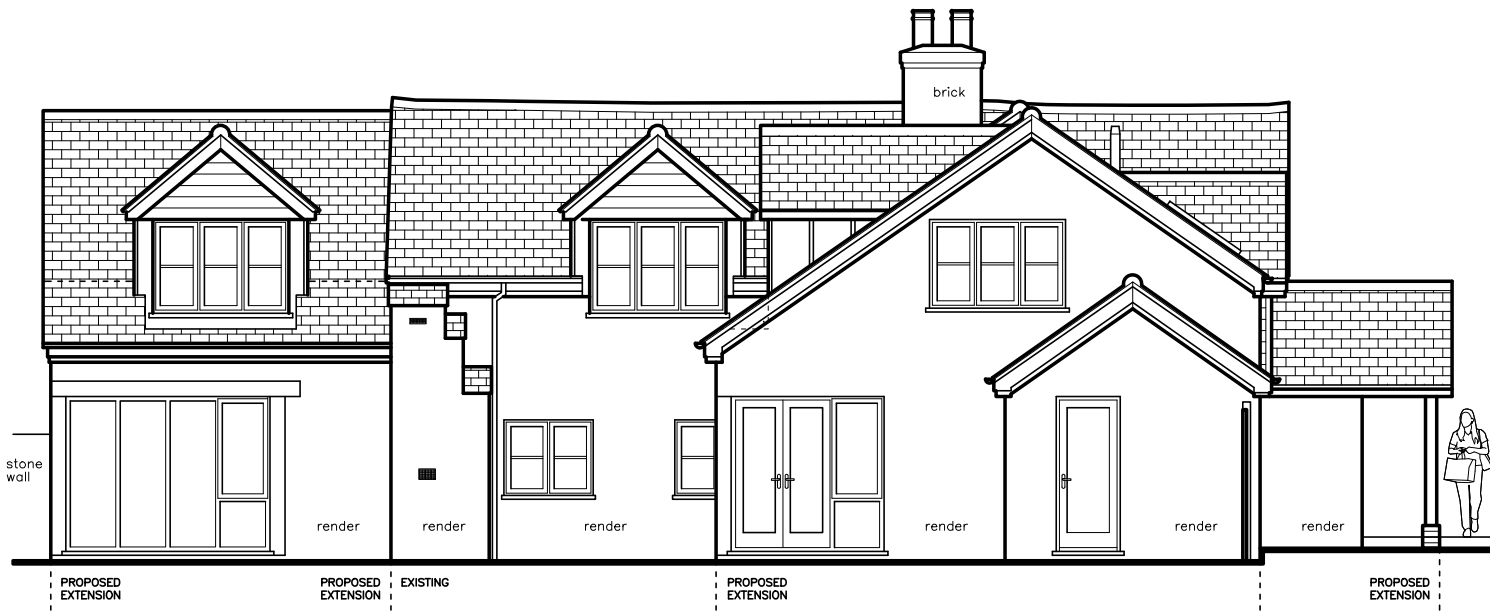
PROPOSED SOUTH EAST ELEVATION REF. NO.: BD635 PE3