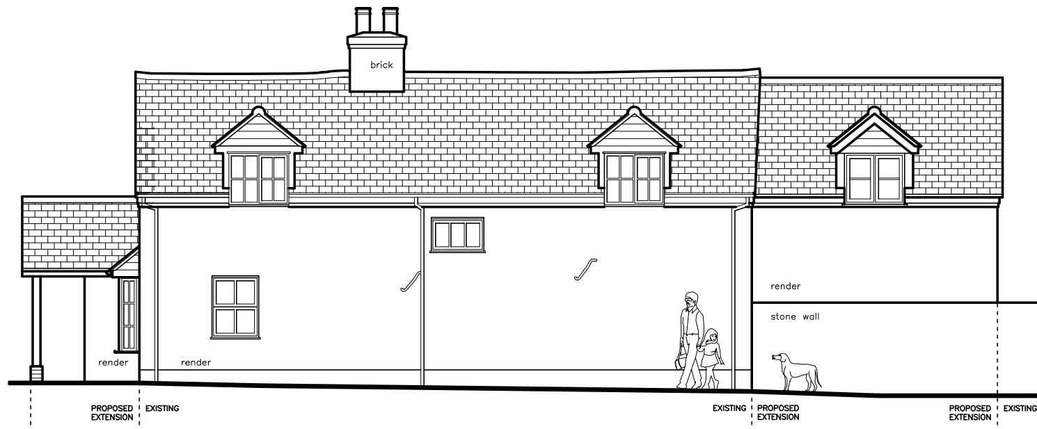
PROPOSED NORTH WEST ELEVATION REF. NO.: BD635 PE1