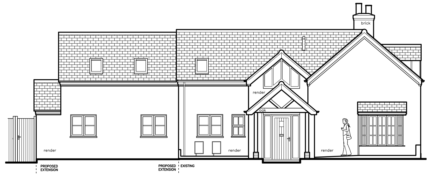
PROPOSED NORTH EAST ELEVATION REF. NO.: BD635 PE2