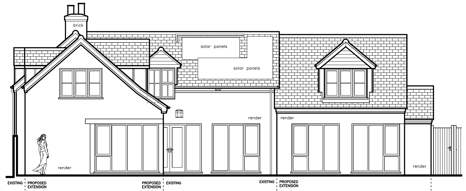
PROPOSED SOUTH WEST ELEVATION REF. NO.: BD635 PE4