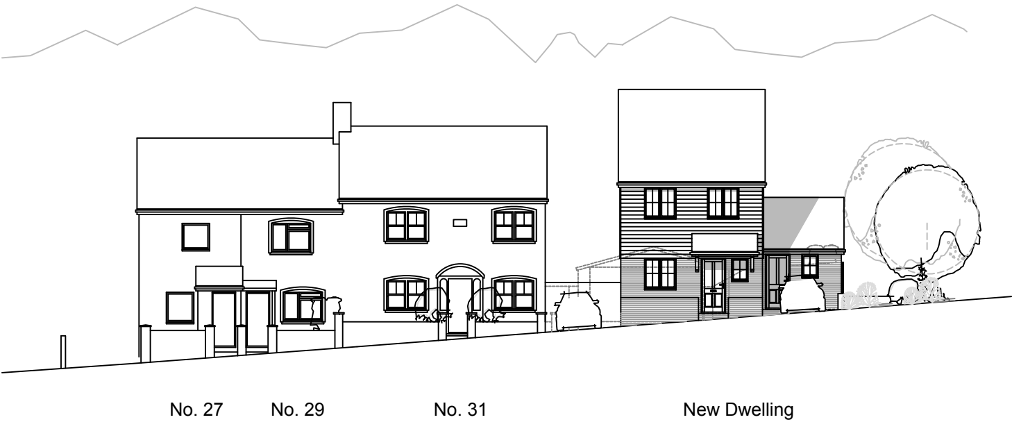
Proposed Street Elevation along Wood Lane