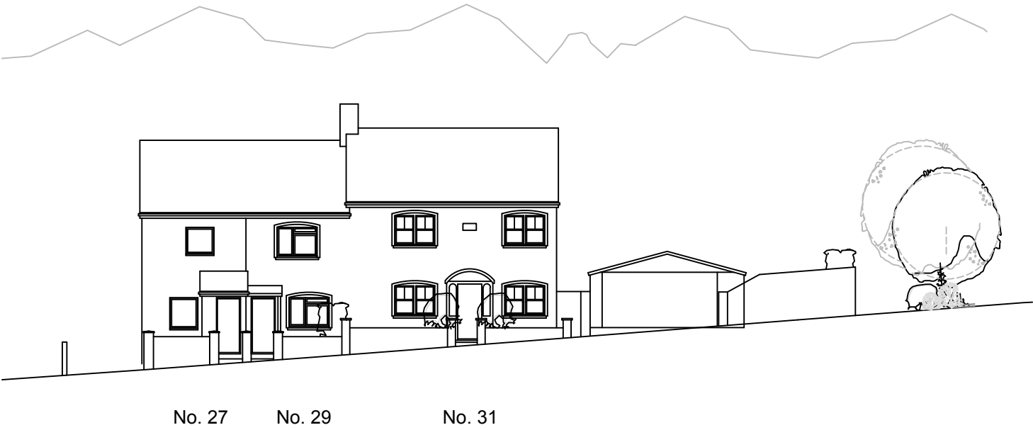
Existing Street Elevation along Wood Lane