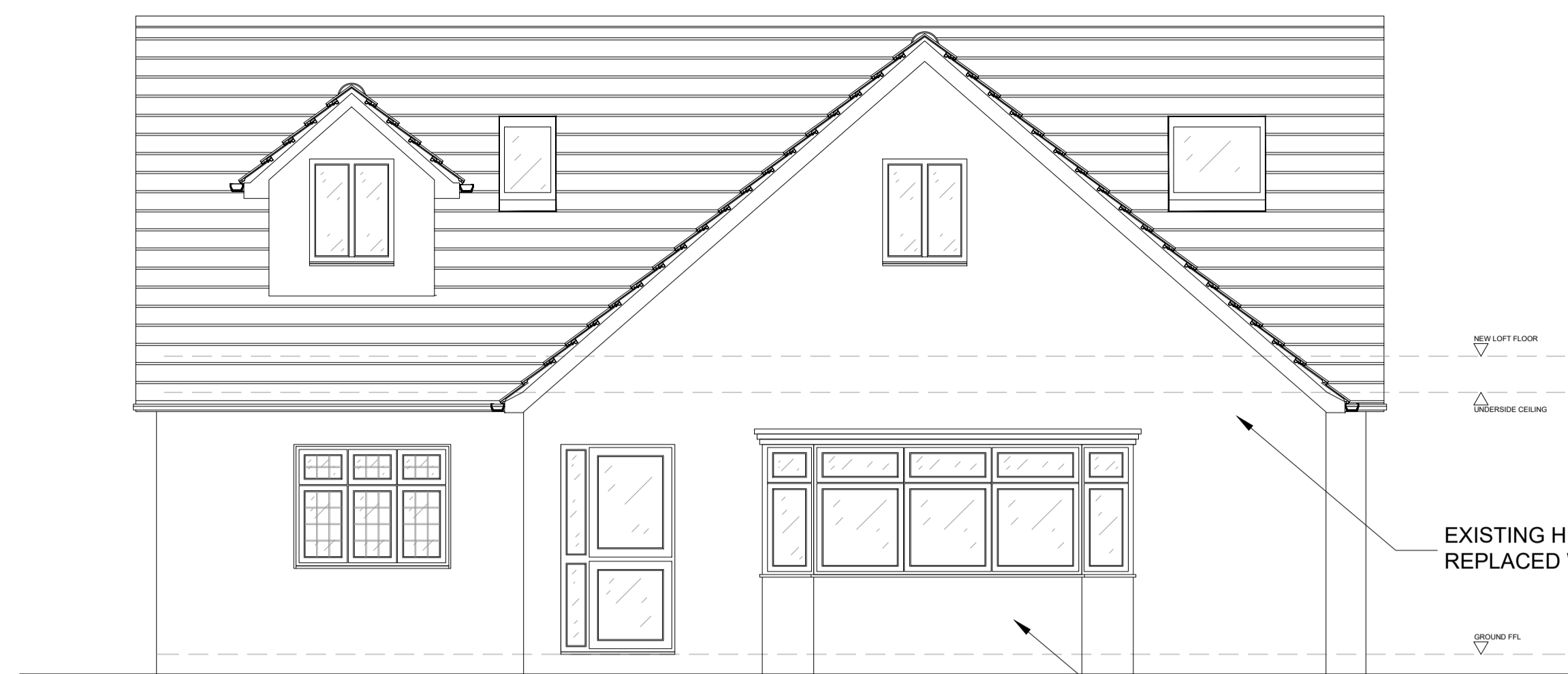
PROPOSED FRONT ELEVATION SCALE 1:50 @ A1 / 1:100 @ A3

EXISTING HUNG TILES TO BE REPLACED WITH RENDER.