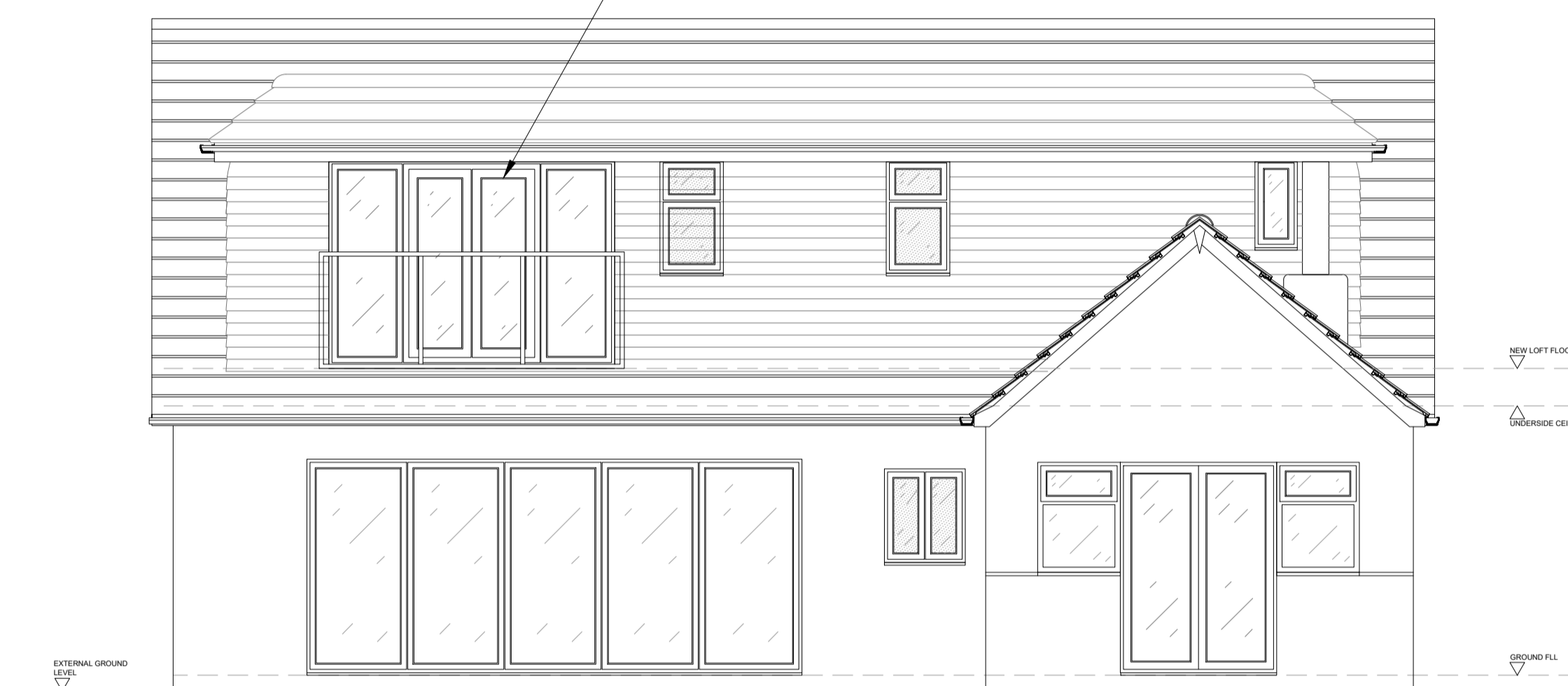
PROPOSED REAR ELEVATION SCALE 1:50 @ A1 / 1:100 @ A3