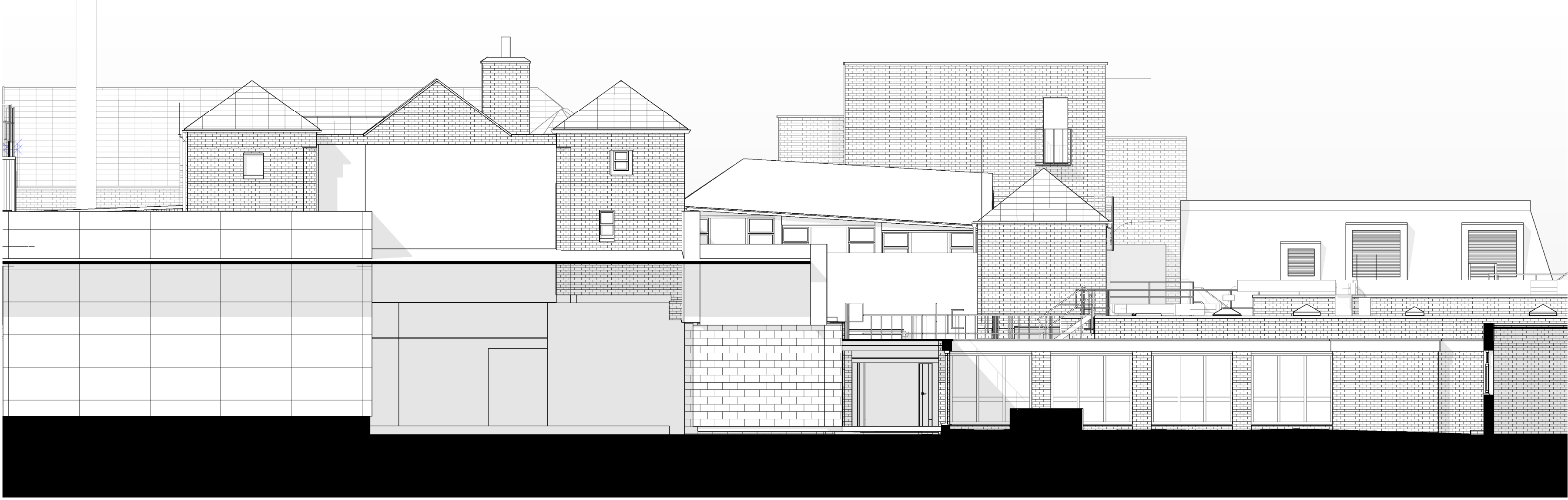
5 Existing Elevation 5