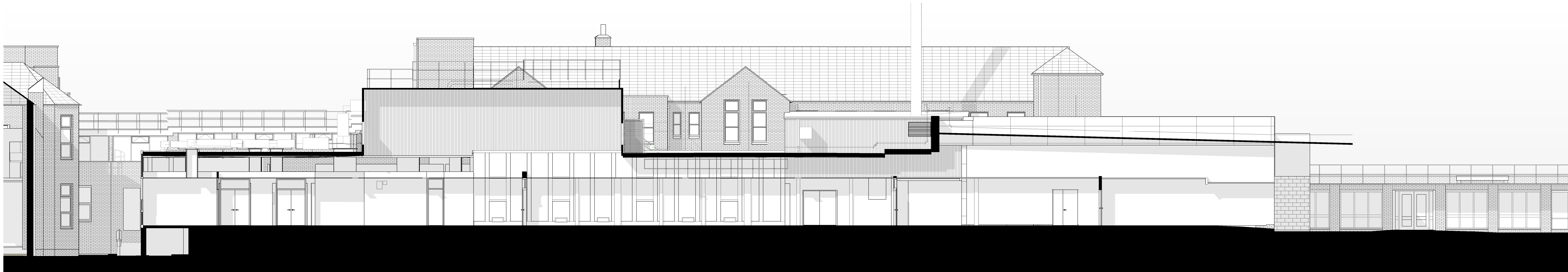
3 Existing Elevation 3 1 : 100