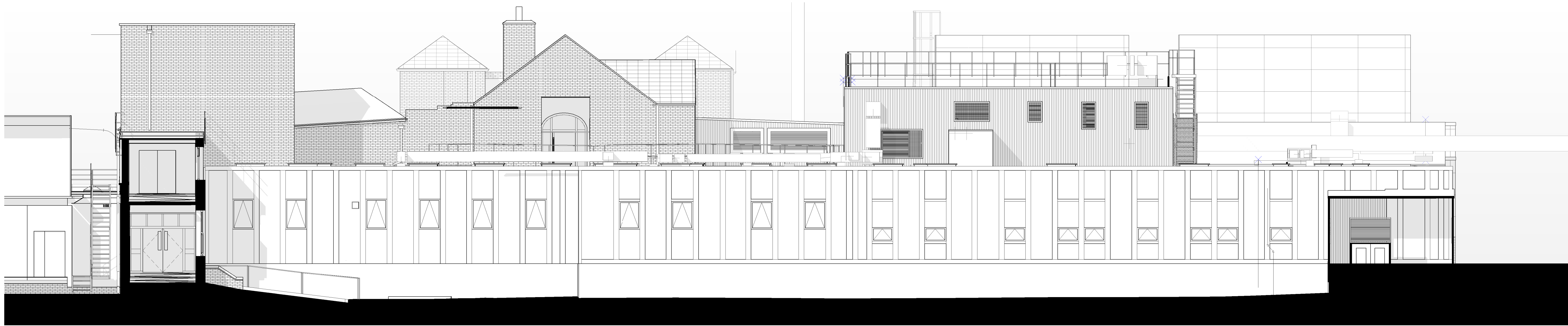
1 Existing Elevation 1 1 : 100