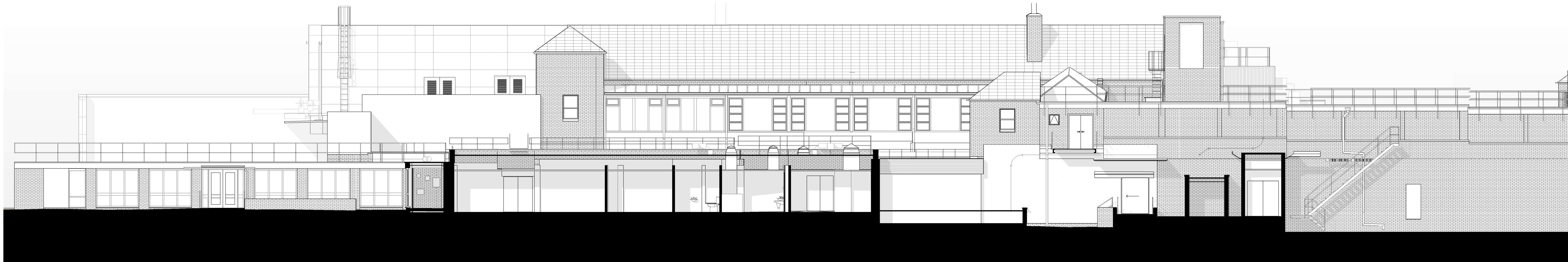
4 Existing Elevation 4 1 : 100