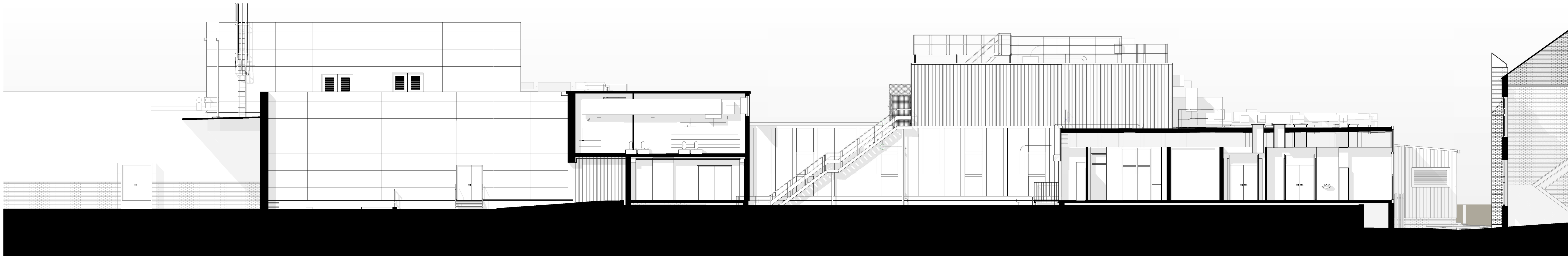
2 Existing Elevation 2 1 : 100