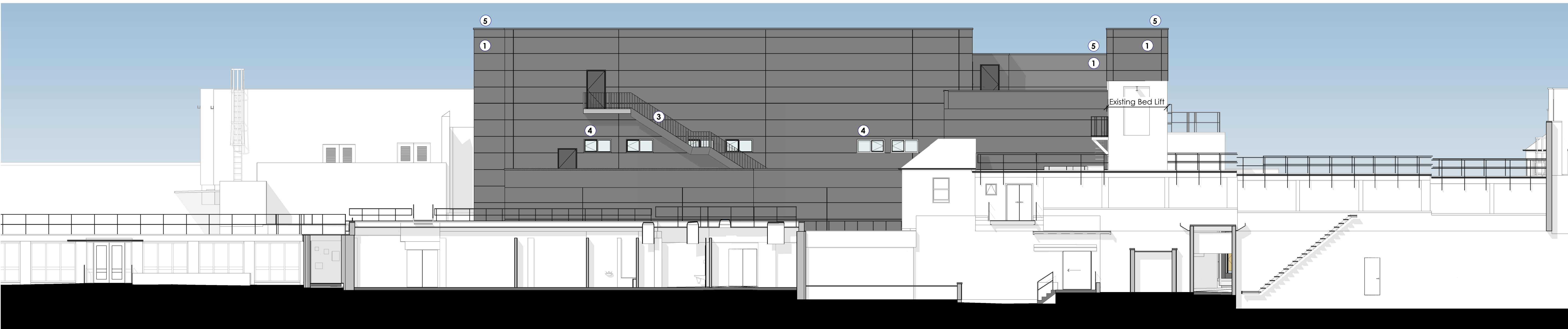
4 Proposed Elevation 4 Copy 1 1 : 100