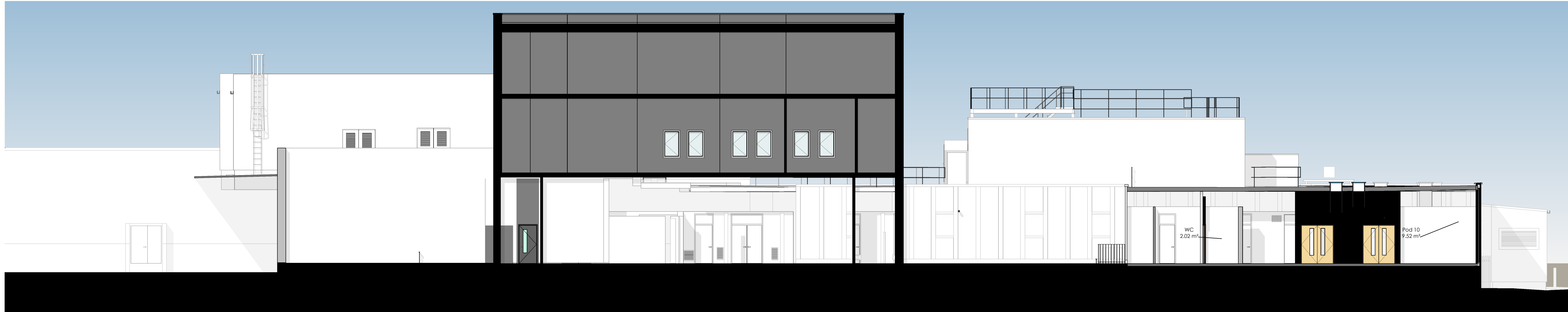
2 Proposed Elevation 2 Copy 1 1 : 100