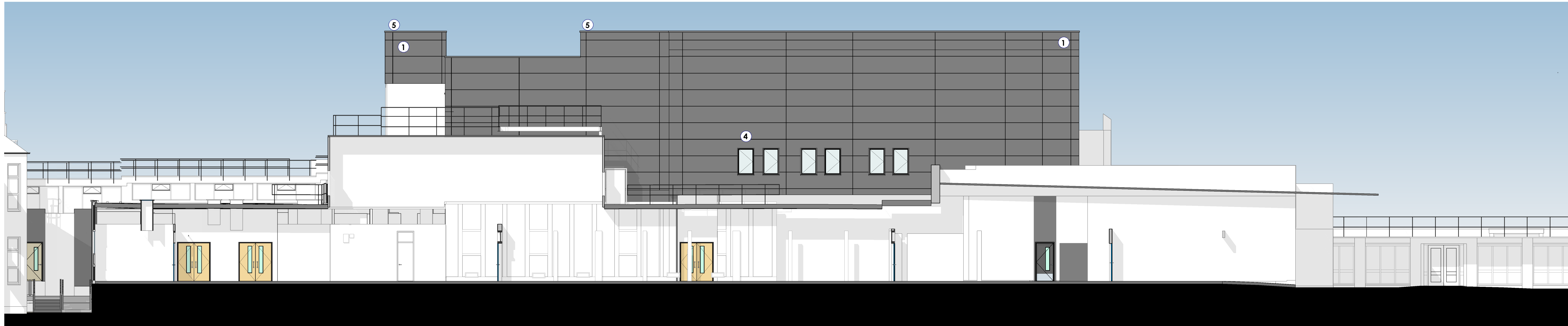
3 Proposed Elevation 3 Copy 1 1 : 100