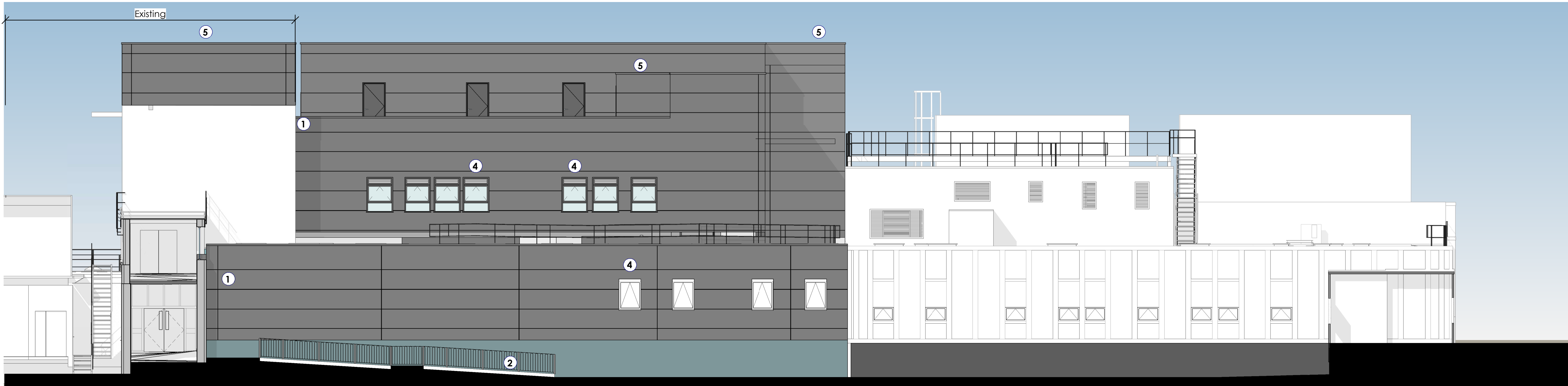
1 Proposed Elevation 1 Copy 1 1 : 100