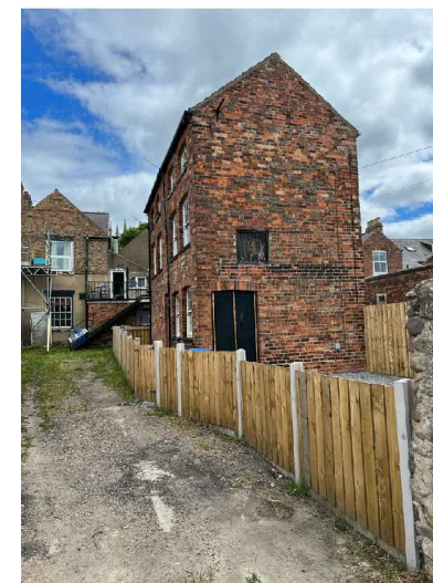
View from West