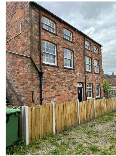
View from North