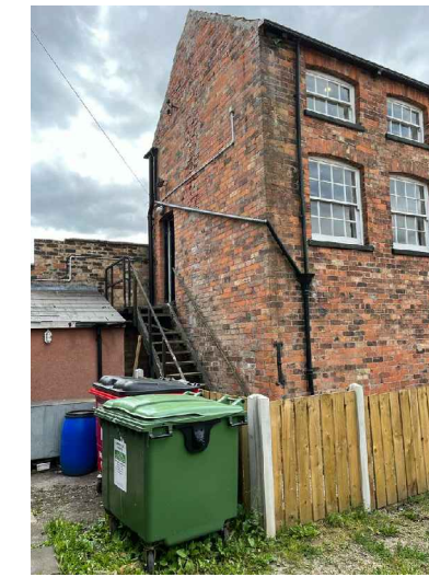
View from North