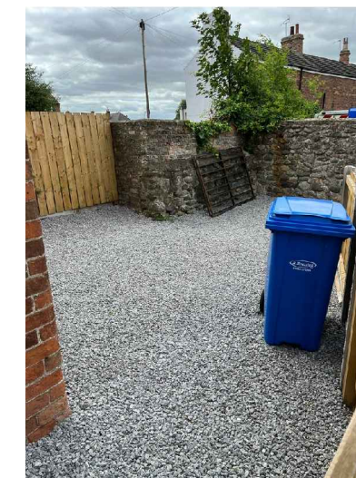
View of Car Park