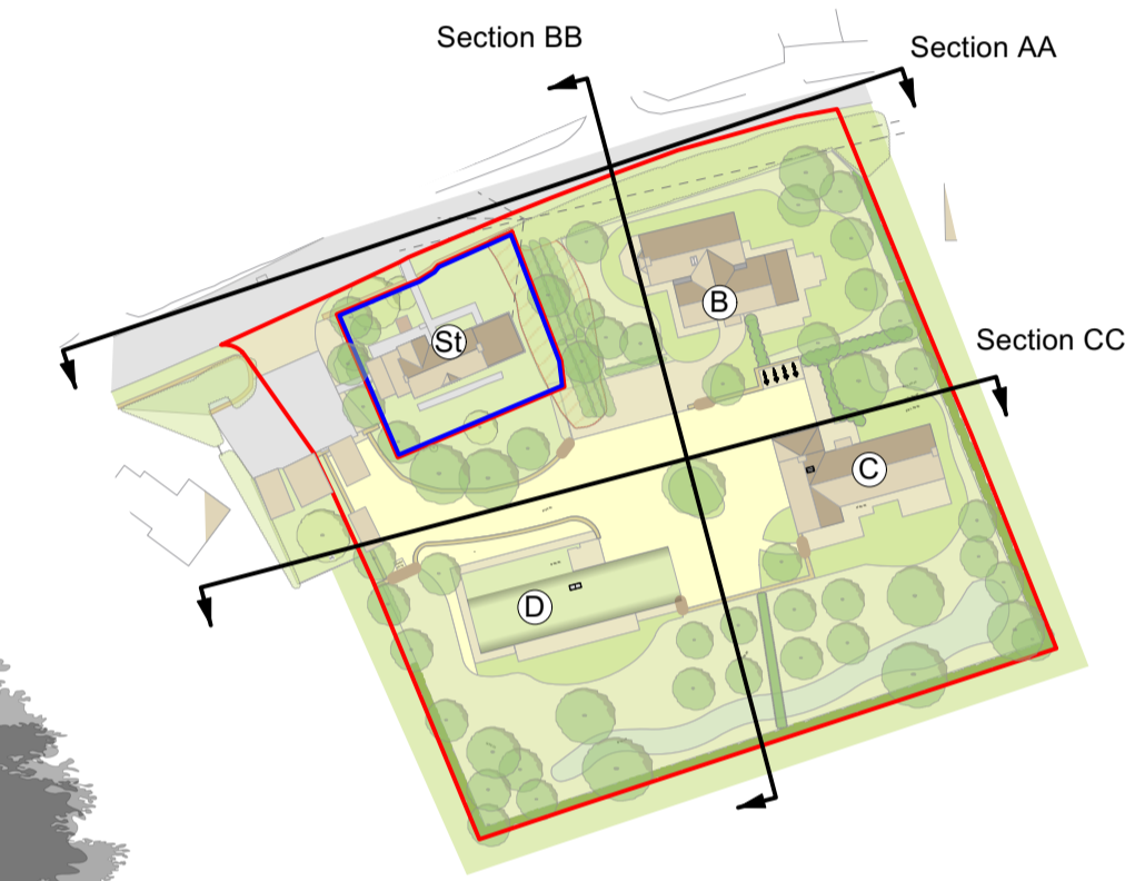
Reference Plan Not to scale