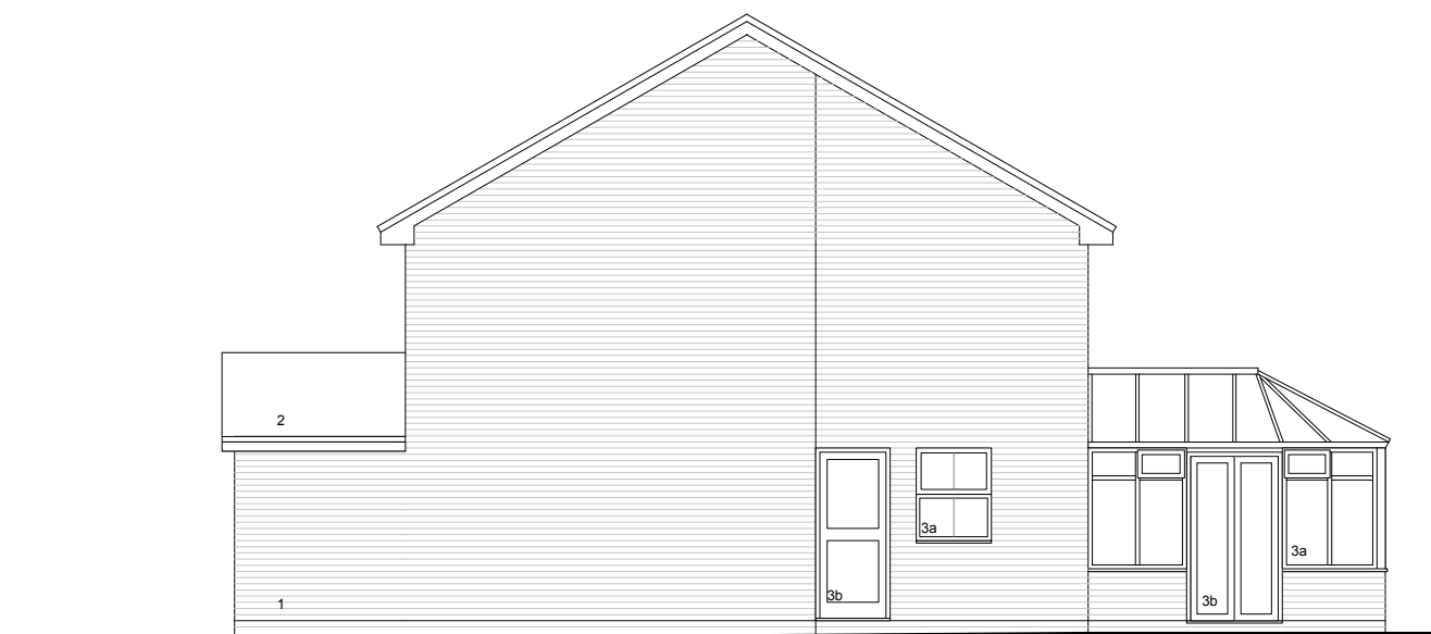
Existing Side (West) Elevation