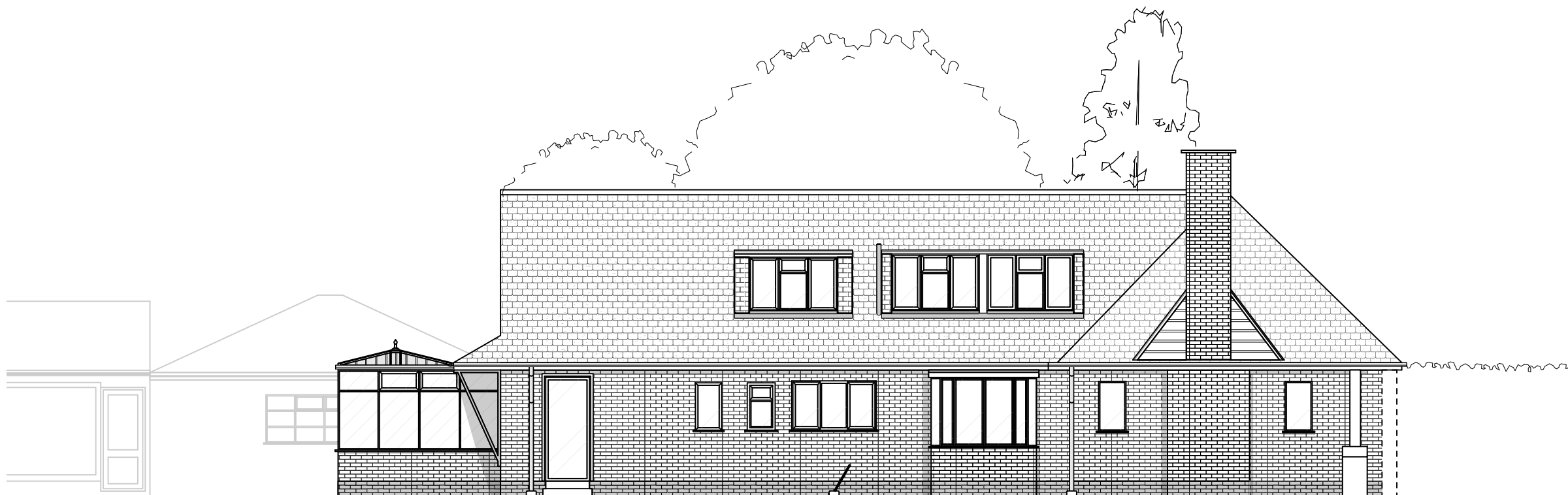
2 Existing North West Elevation Scale: 1:100