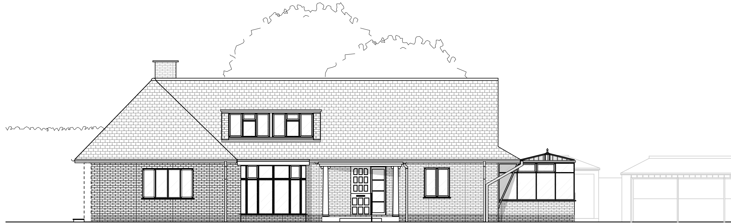
1 Existing South East Elevation Scale: 1:100