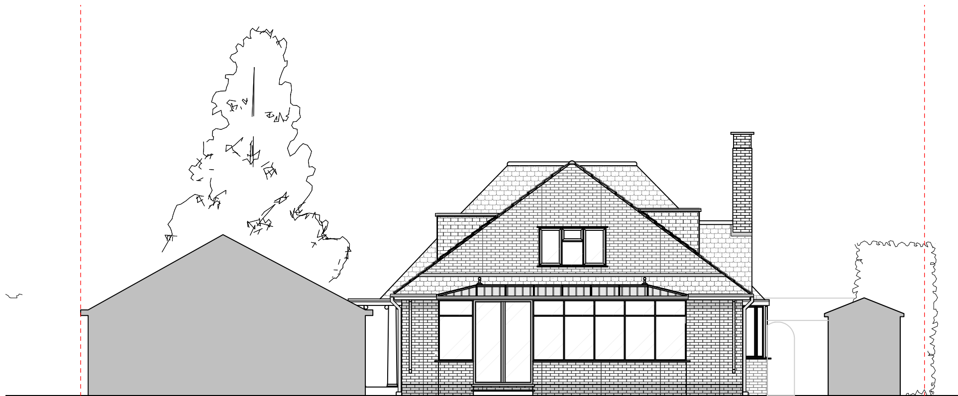
2 Existing North East Elevation Scale: 1:100