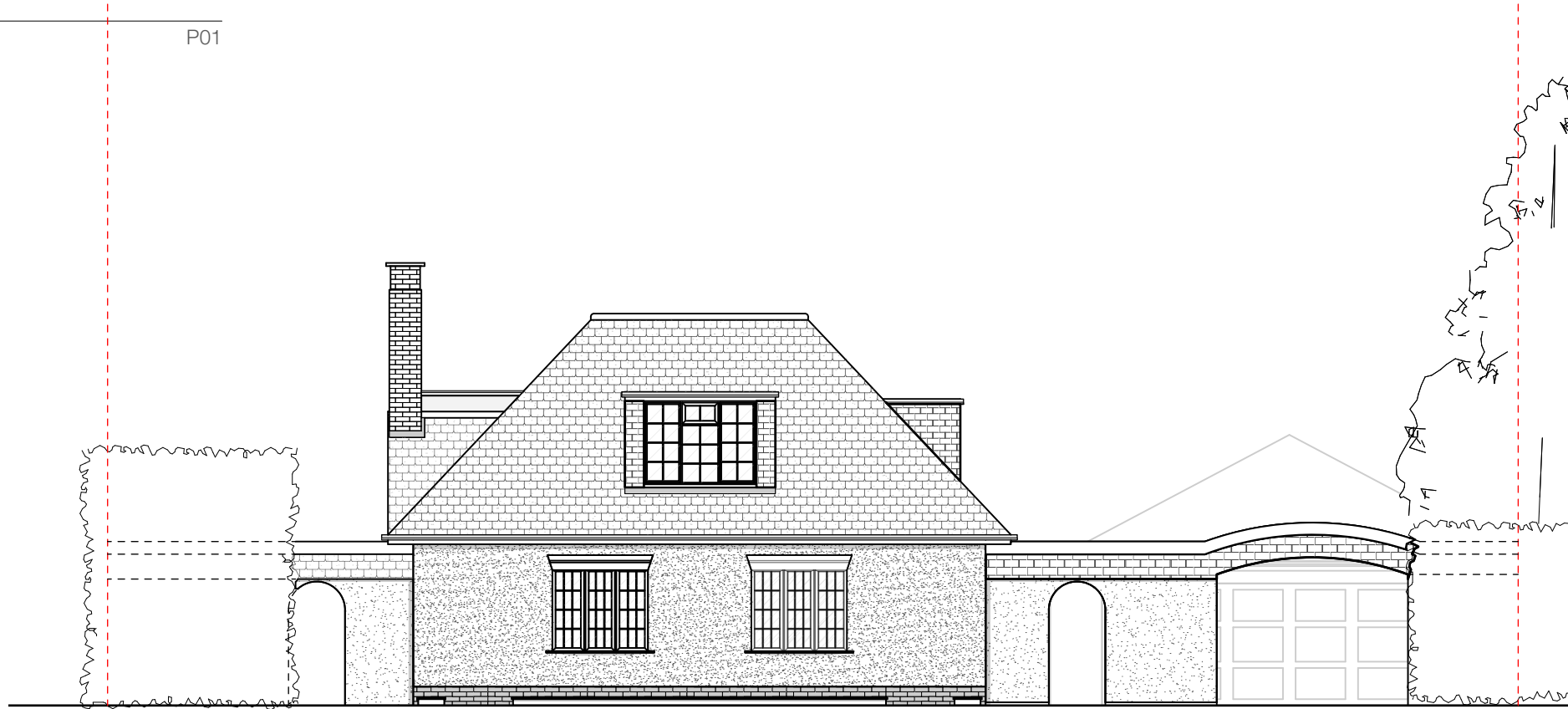
1 Existing South West Elevation Scale: 1:100