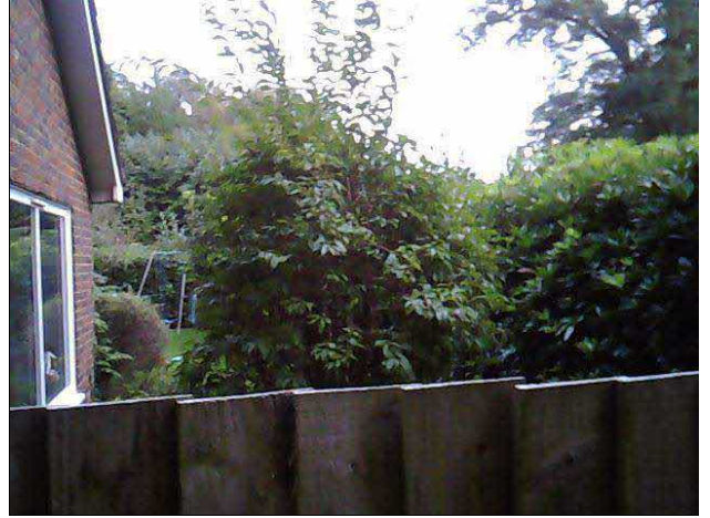
S2 - Forsythia