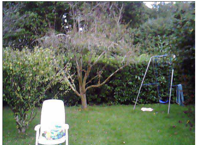
T6 - Prunus