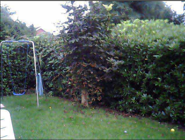
T7 - Horse Chestnut