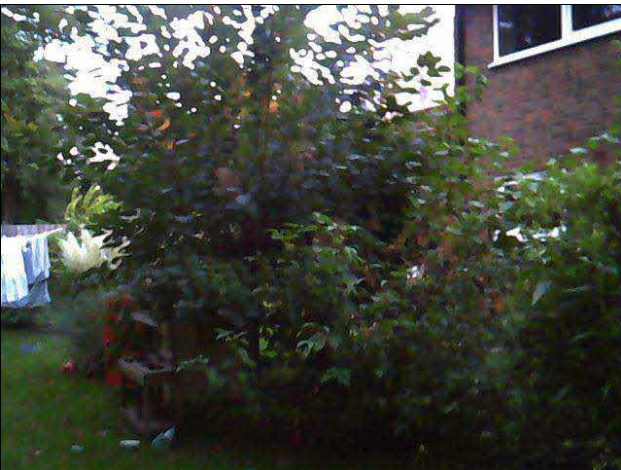
SG5 - Mixed species shrubs