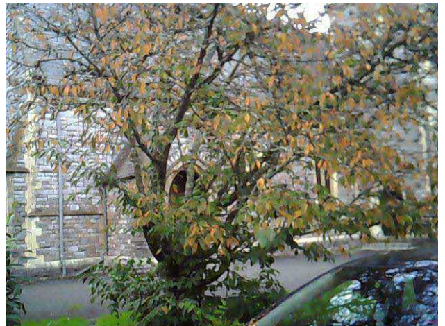
T1 - Prunus