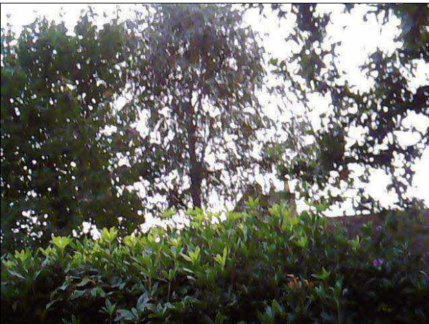
T11 - Birch