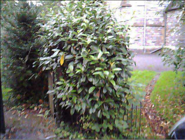
S1 - Laurel (Cherry)