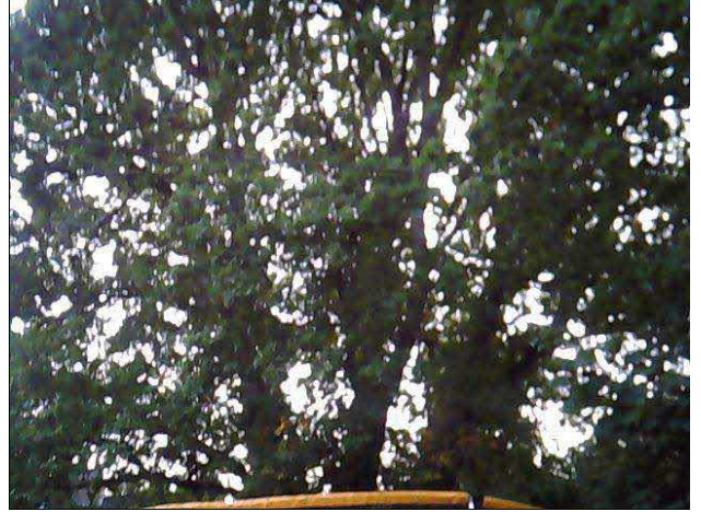
T9 - Oak