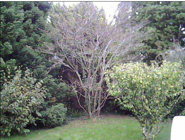
T5 - Snowy Mespil