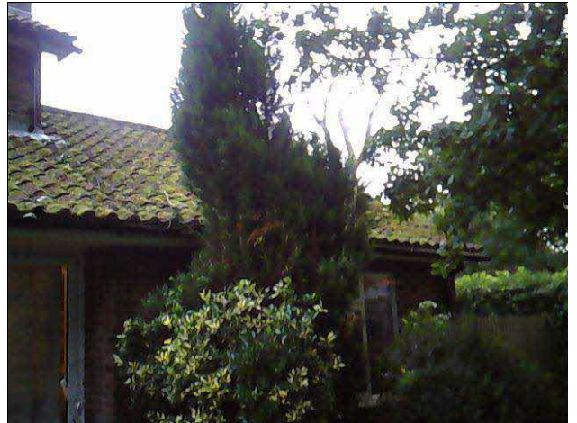
T8 - Cypress