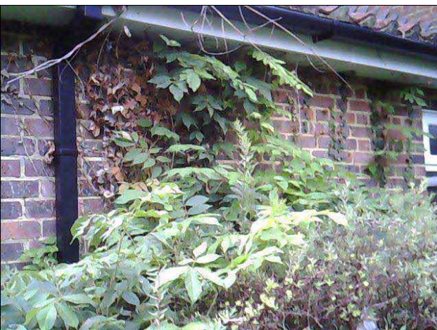
C2 - Wisteria