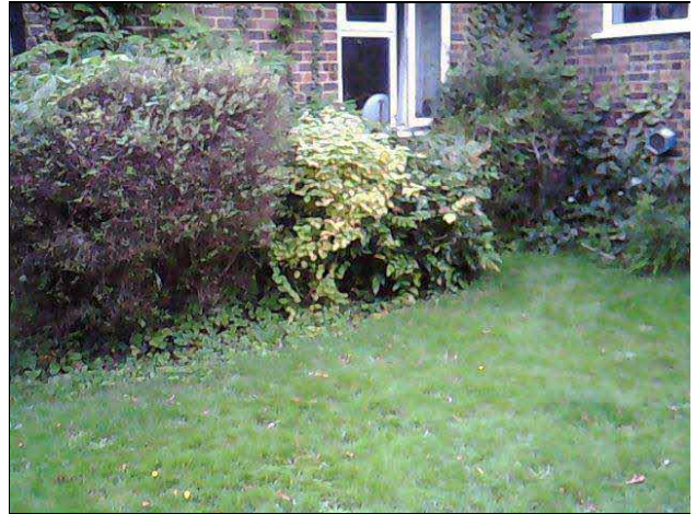
SG2 - Mixed species hedge