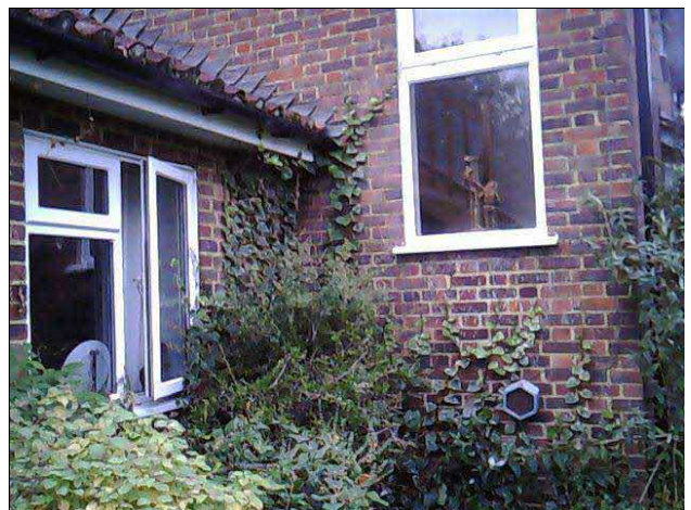
C1 - Ivy