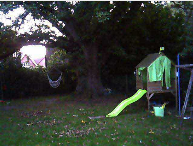
T9 - Oak