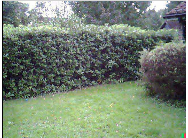
H2 - Mixed species hedge