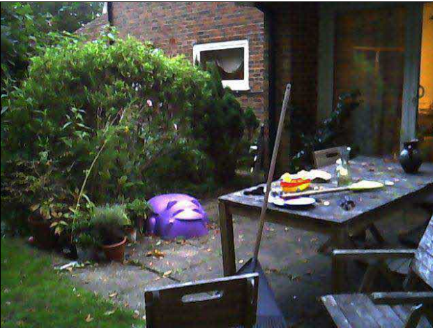
SG4 - Mixed species shrubs