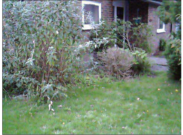
SG1 - Mixed species shrubs