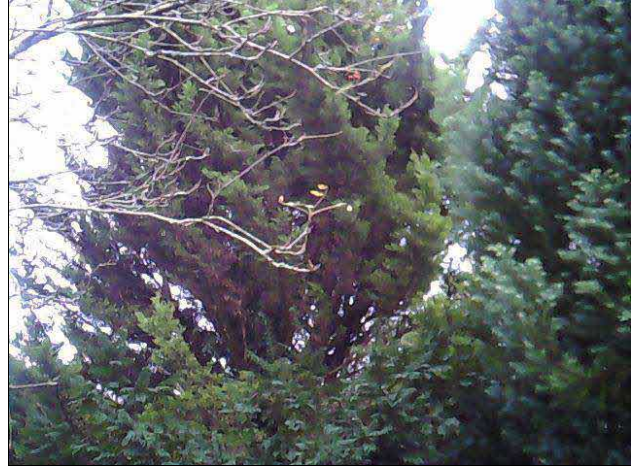
T4 - Cypress