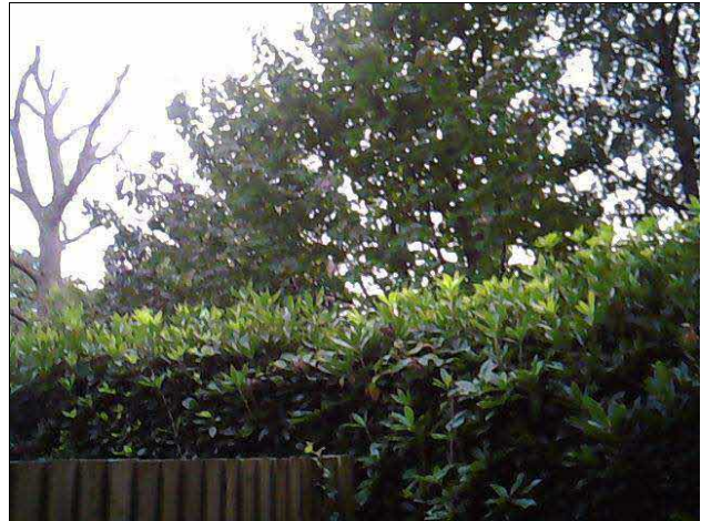
T10 - Maple (Norway)