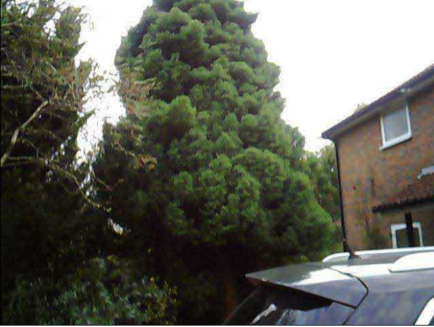
T3 - Juniper