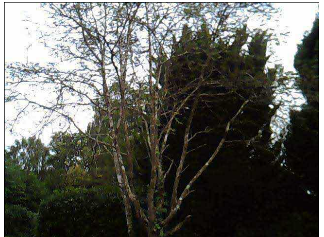
T2 - Rowan