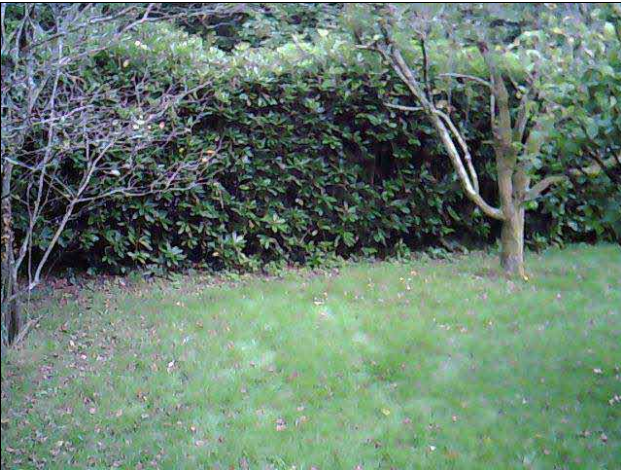
H1 - Mixed species hedge