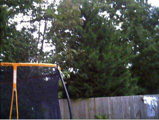
TG1 - Mixed species group