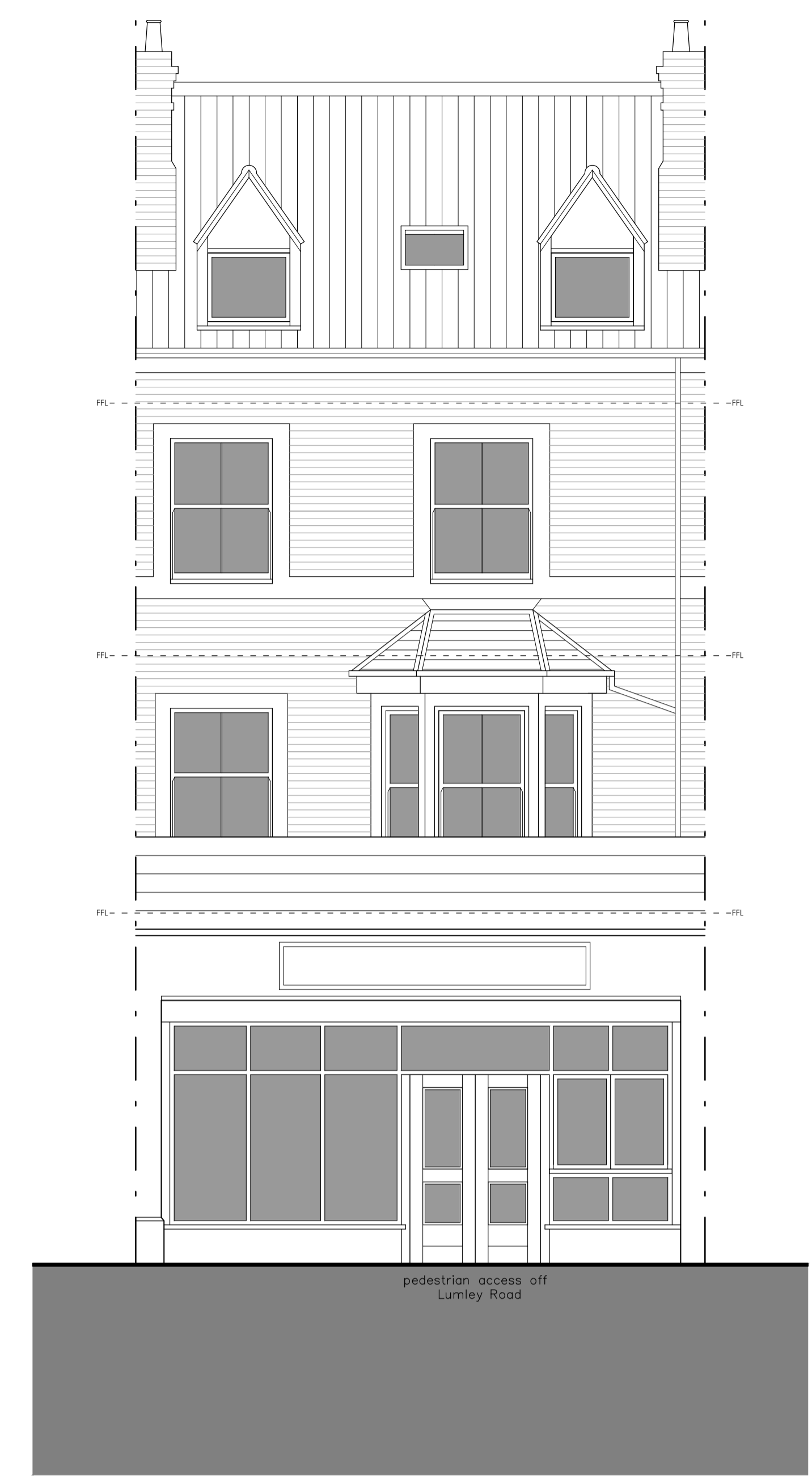
EXISTING NORTH ELEVATION 1:50 @ A1