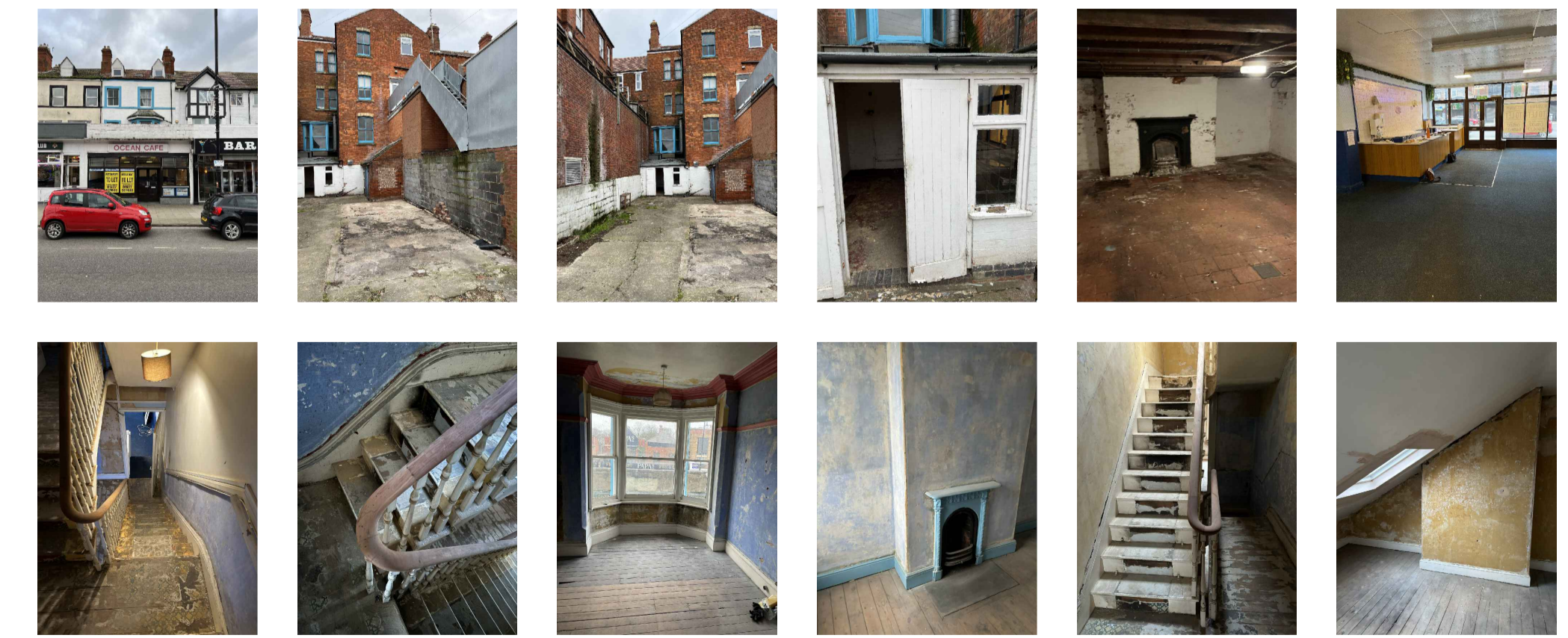
EXISTING SITE PHOTOGRAPHS NTS @ A1

Client Mr N Iqbal Project Alterations and Modifications Address 132 Lumley Road, Skegness Drawing Existing Elevations & Section Scale/Document Size 1:50 / 1:100 @ A1 Date January 2024 Drawing No. 19151/24/05a