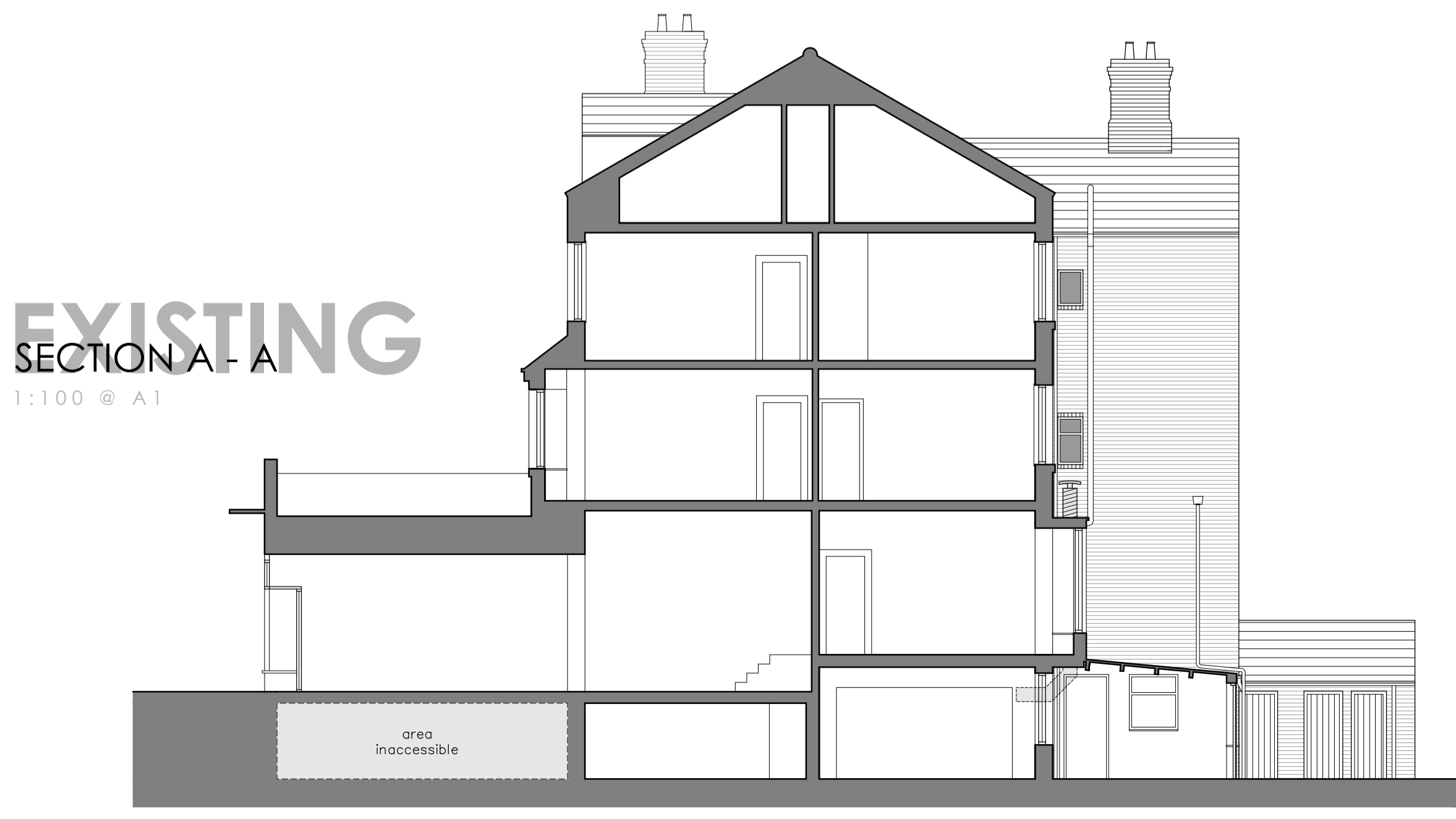
EXISTING SECTION A-A 1:100 @ A1