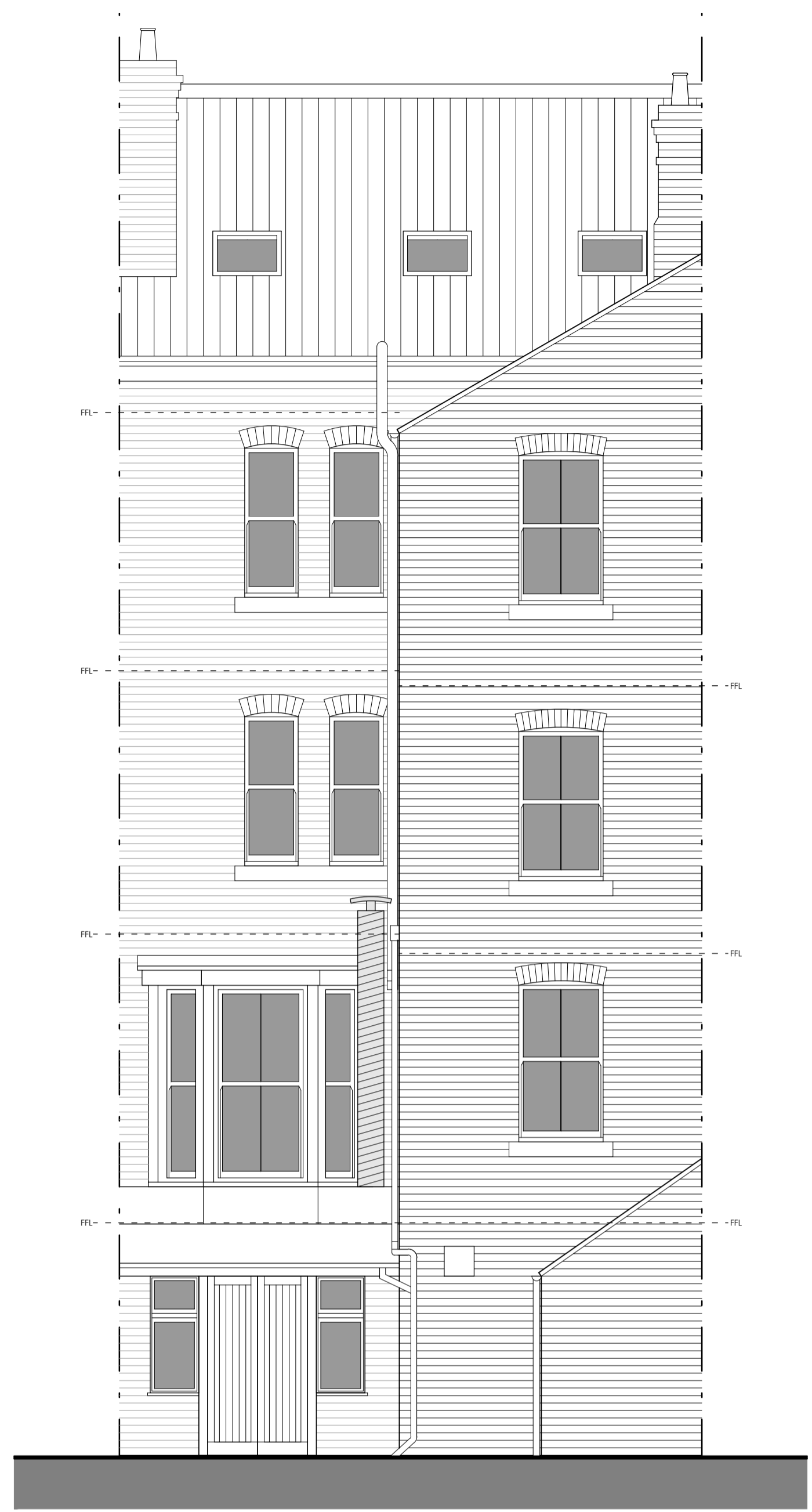
EXISTING SOUTH ELEVATION 1:50 @ A1