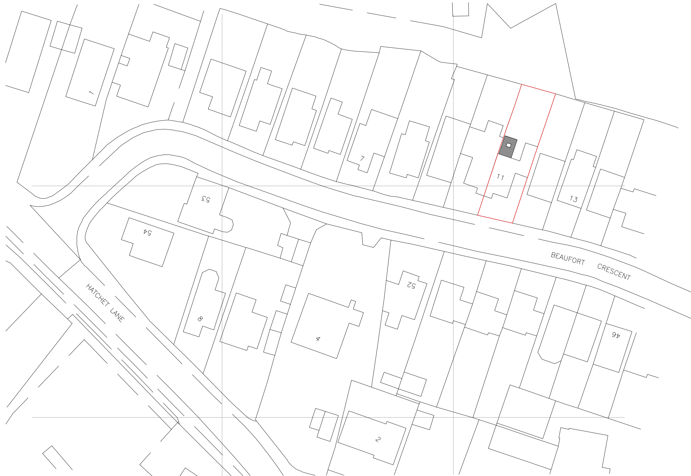
11 Beaufort Cres, Stoke Gifford Block plan (scale 1:500@A3)