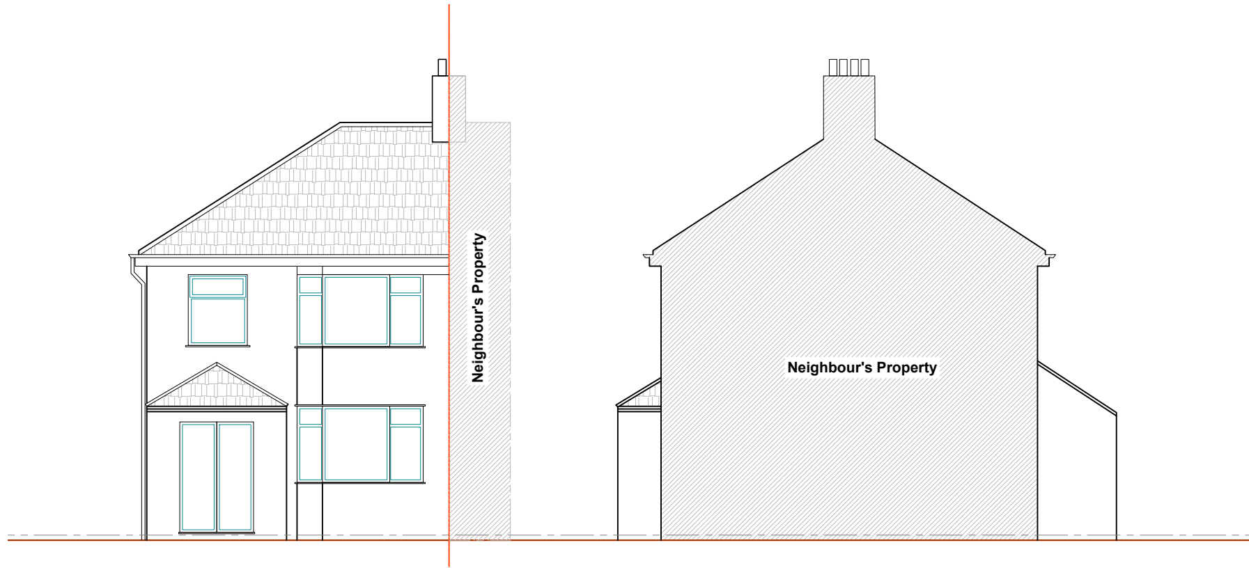
4 EXISTING FRONT ELEVATION SCALE 1:100 @ A3

General Notes: All dimensions are in millimeters unless noted otherwise. All dimensions to be verified on site. For any discrepancies and omissions, it is recipient's responsibility to verify the same specifically with the designer. The copyright of this drawing is held by ALL1HOUSE. No unauthorized use or copies are permitted without our consent.