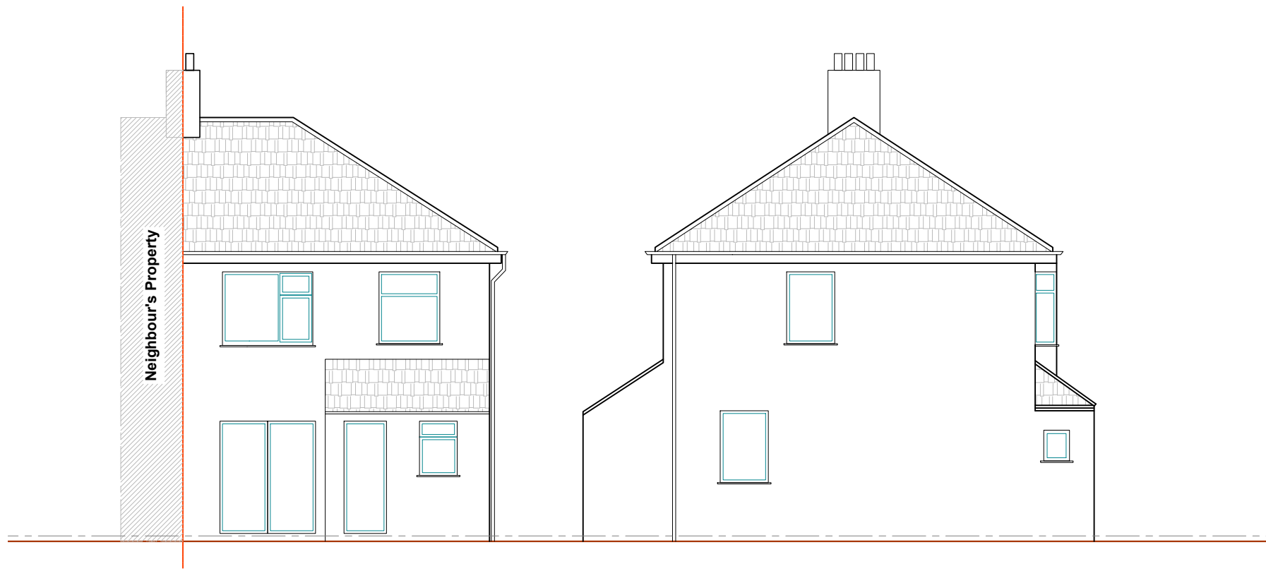
6 EXISTING REAR ELEVATION SCALE 1:100 @ A3