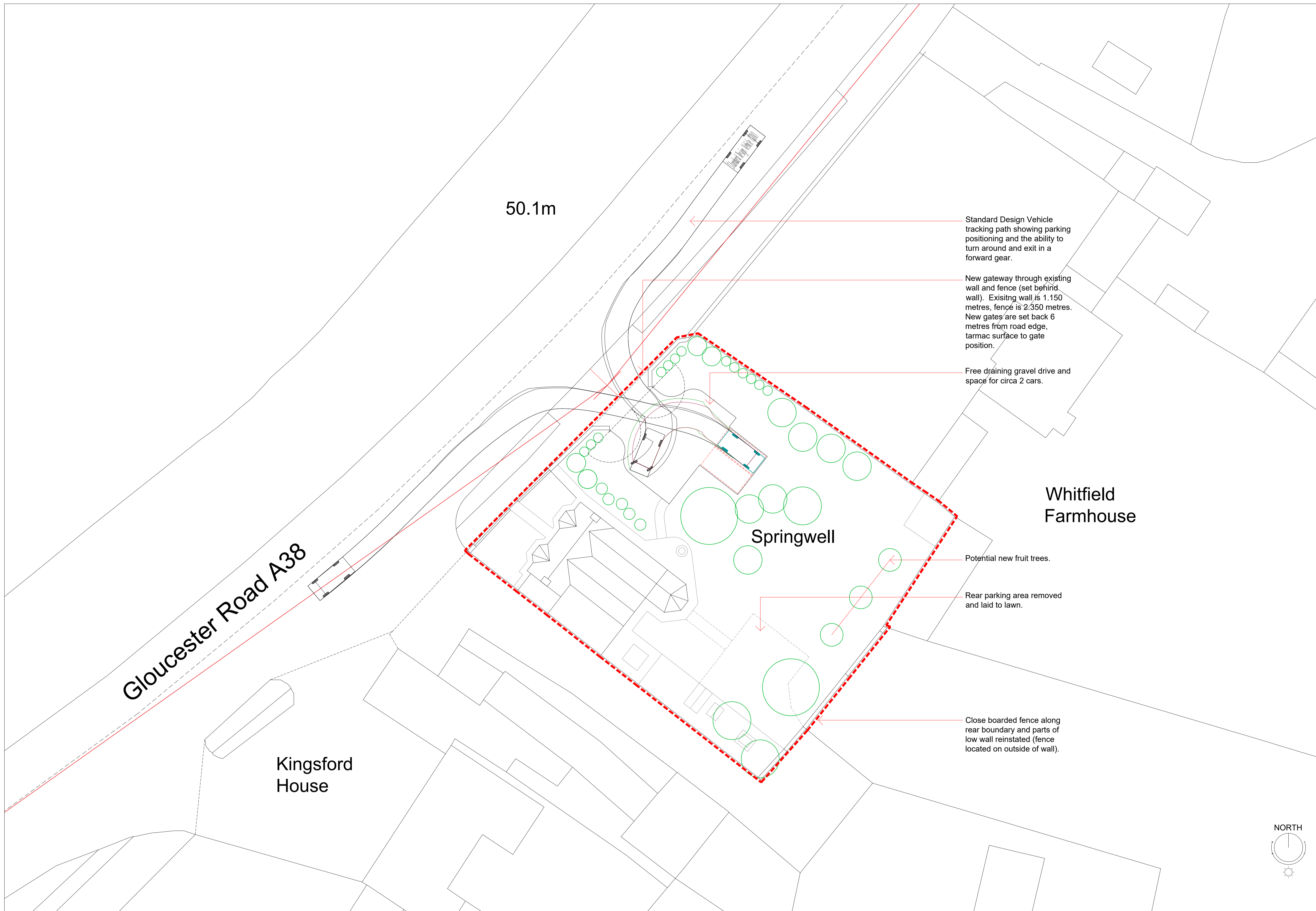
Highways Access Detail Plan 1:100@A1 & 1:200@A3