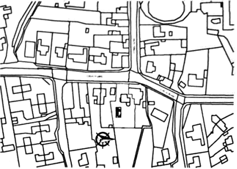
PROPOSED SITE LOCATION PLAN SCALE 1:12500