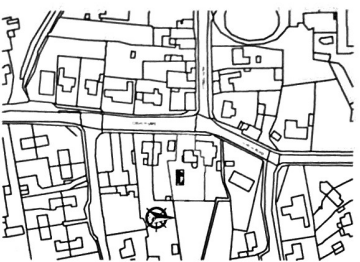
PROPOSED SITE LOCATION PLAN SCALE 1:1250

© MARTIN OSBORN DESIGN SERVICES 1. NOT FOR SCALE FROM DRAWING 2. ALL DIMENSIONS IN MILLIMETRES 3. TO BE TAKEN IN CONJUNCTION WITH ALL SPECIFICATIONS ETC. 4. DRAWING IS THE PROPERTY OF MARTIN OSBORN DESIGN SERVICES AND IS NOT TO BE REPRODUCED OR TRANSMITTED IN ANY FORM OR BY ANY MEANS, ELECTRONIC OR MECHANICAL, INCLUDING PHOTOCOPYING, RECORDING, OR BY ANY INFORMATION STORAGE AND RETRIEVAL SYSTEM, WITHOUT THE WRITTEN PERMISSION OF MARTIN OSBORN DESIGN SERVICES.