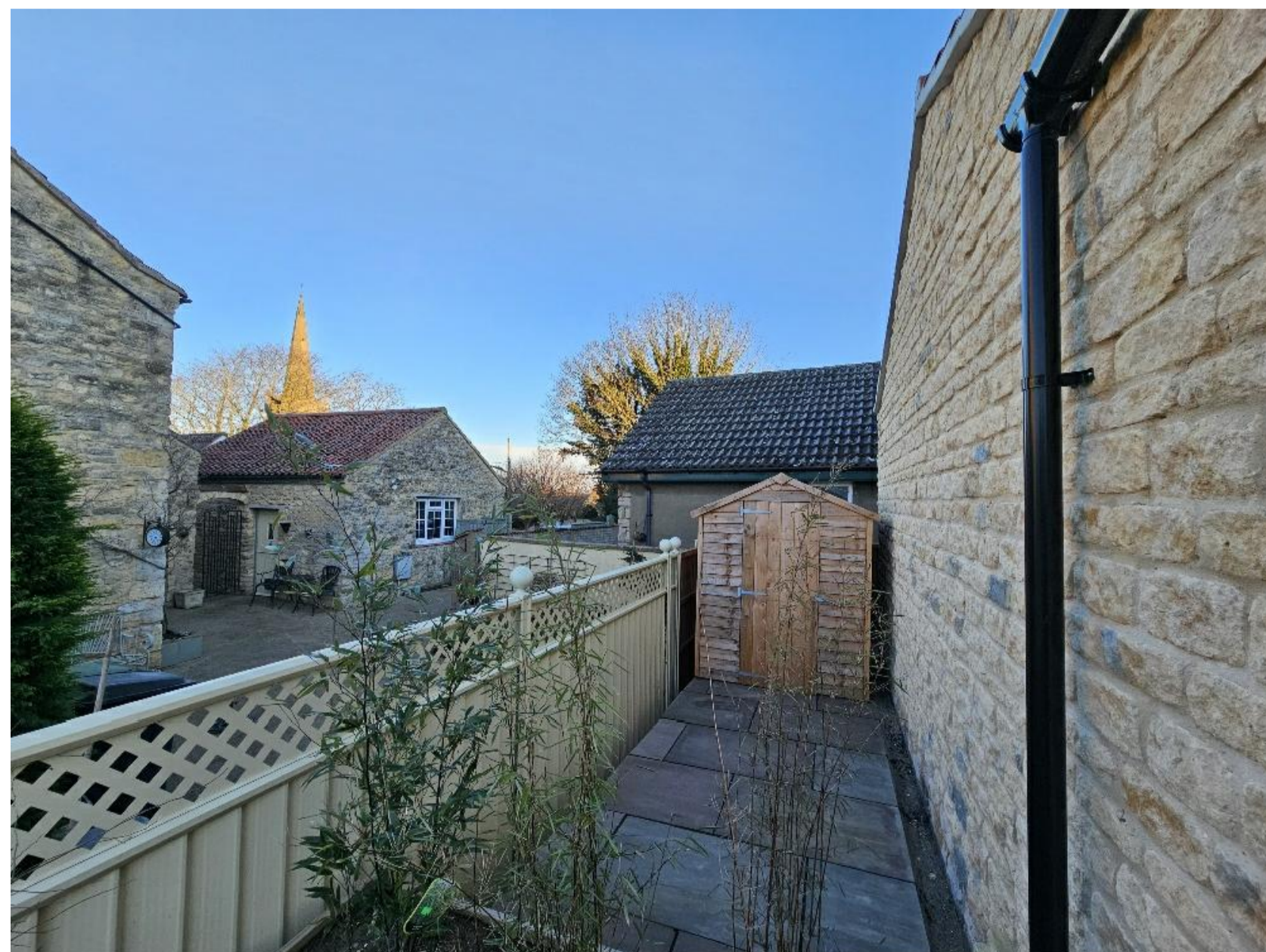
Photo 01 - Timber Garden Shed