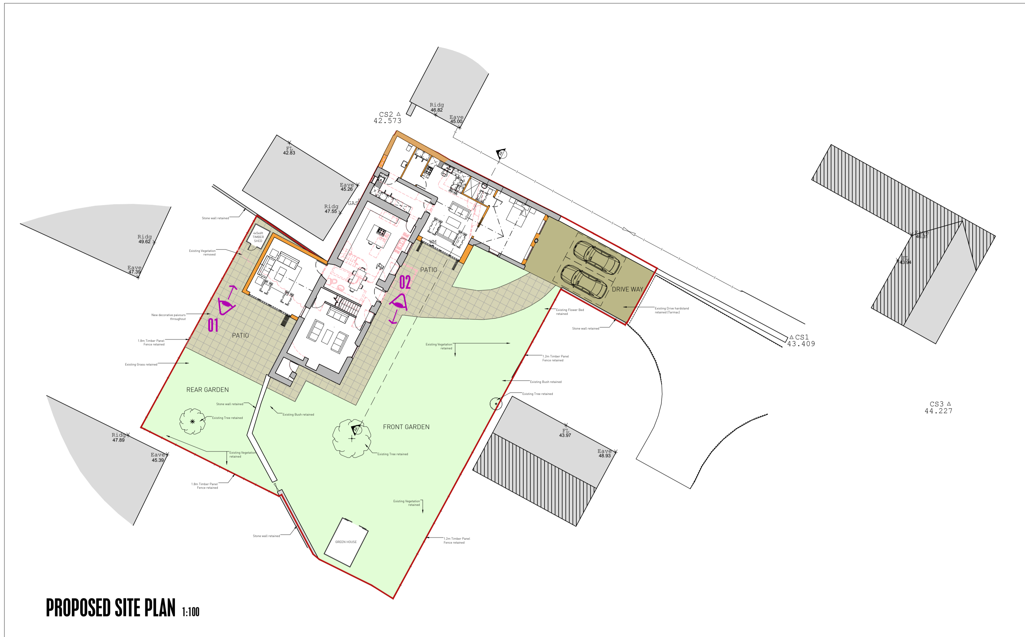
PROPOSED SITE PLAN 1:100