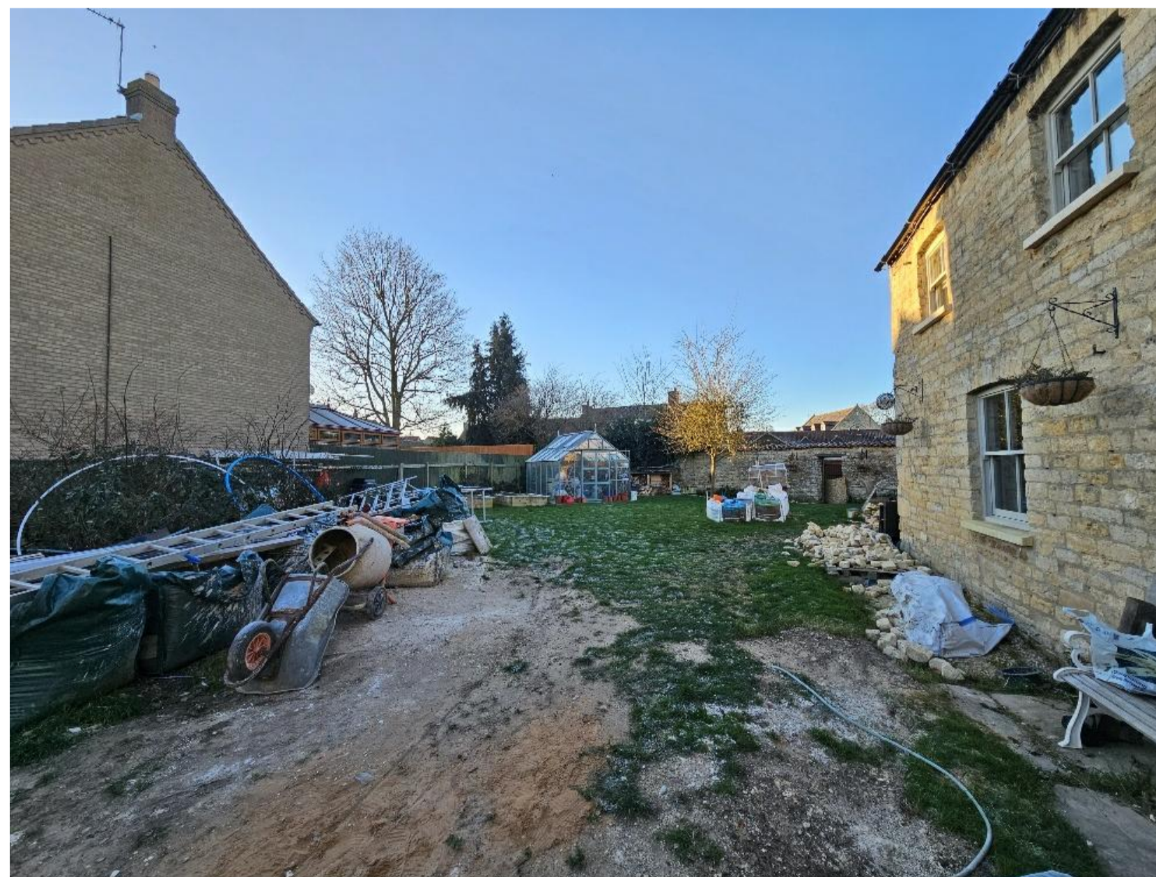
Photo 02 - Green House