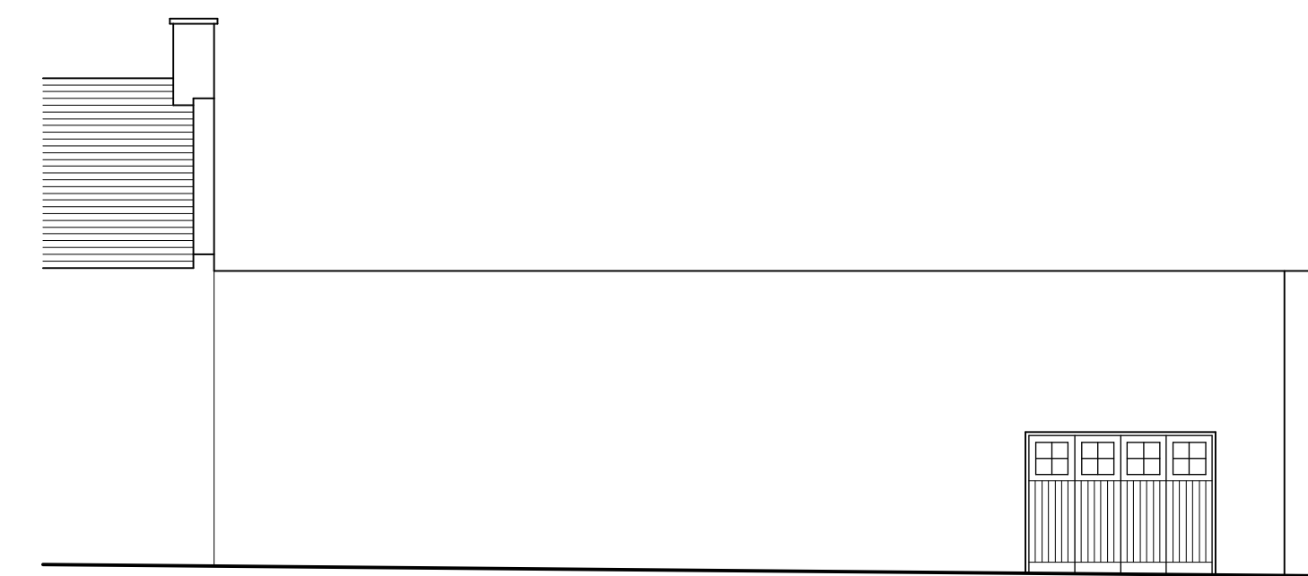
Existing East Elevation (Wall to be Altered) 1:100