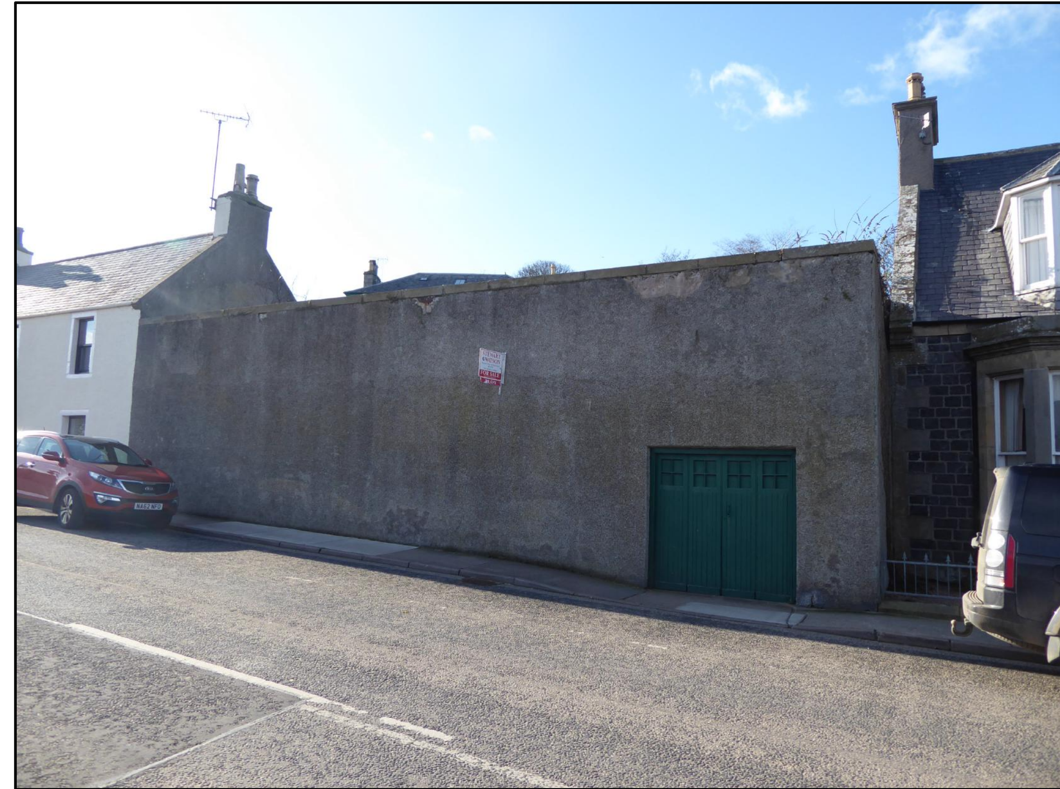
View of Existing Wall and Garage Entrance from Sandyhill Road