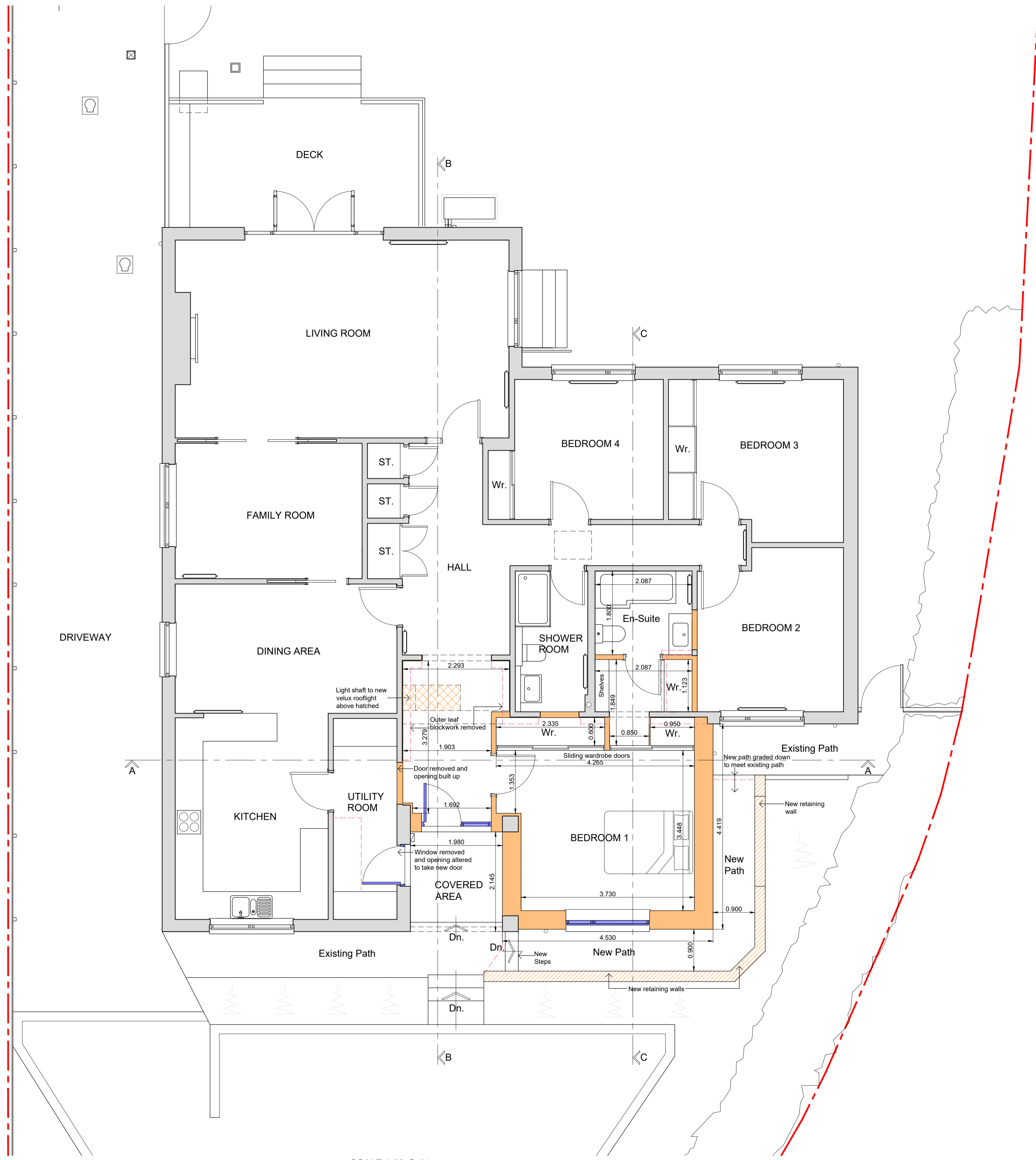
Proposed Floor Plan