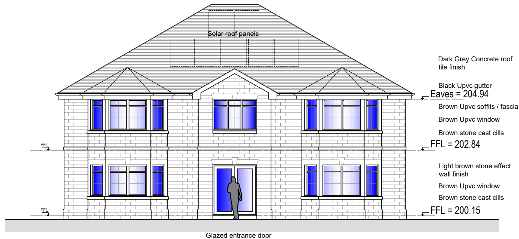
Proposed Front South Elevation 1:100