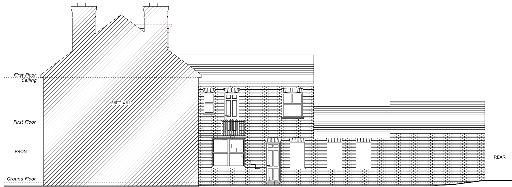
Existing Side 1 Elevation Scale 1:100