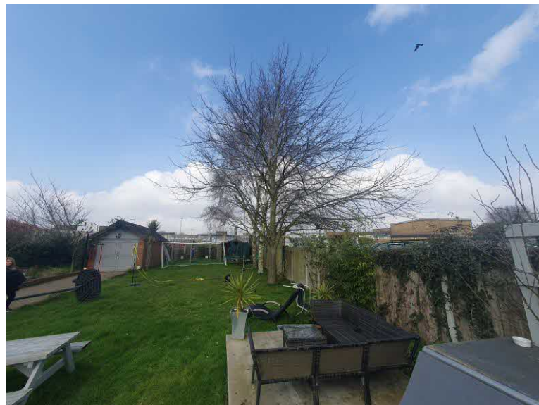
Showing T1 – T3 looking down the garden