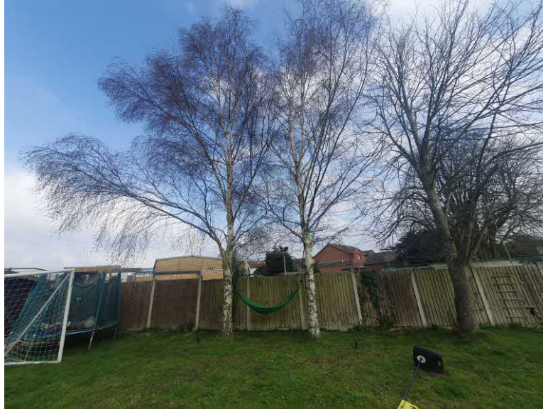
Showing T1 – T3